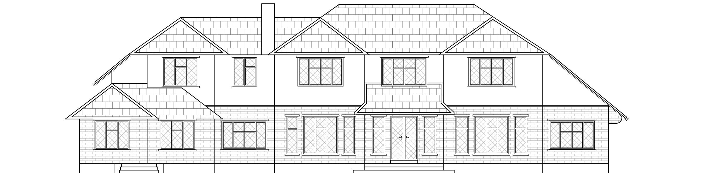
Rear Elevation As Existing - Scale 1:100