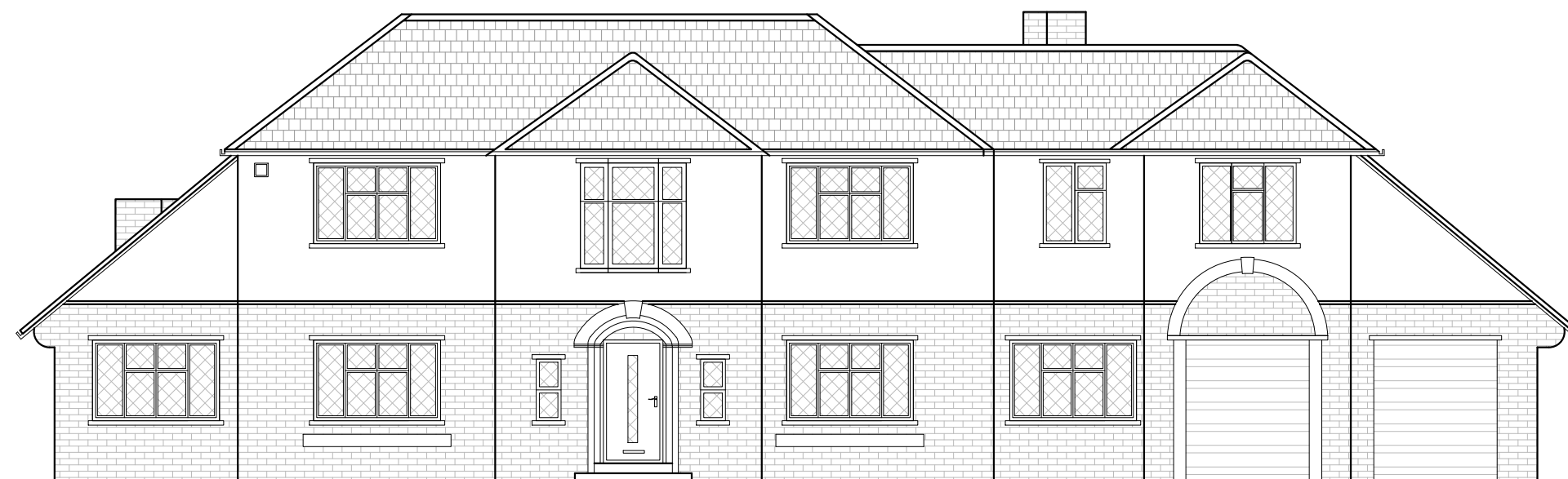
Front Elevation As Existing - Scale 1:100