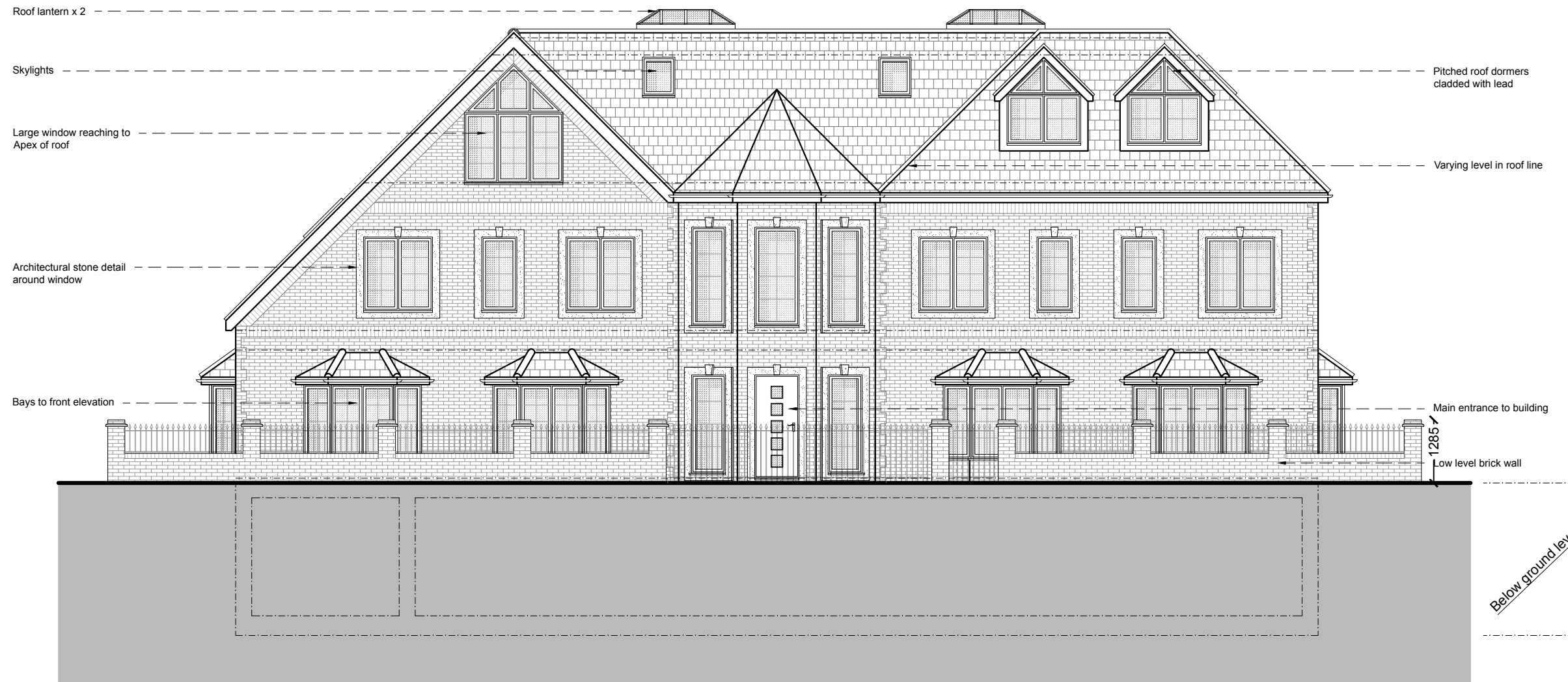
Front Elevation (Front Wall) As Proposed - Scale 1:100