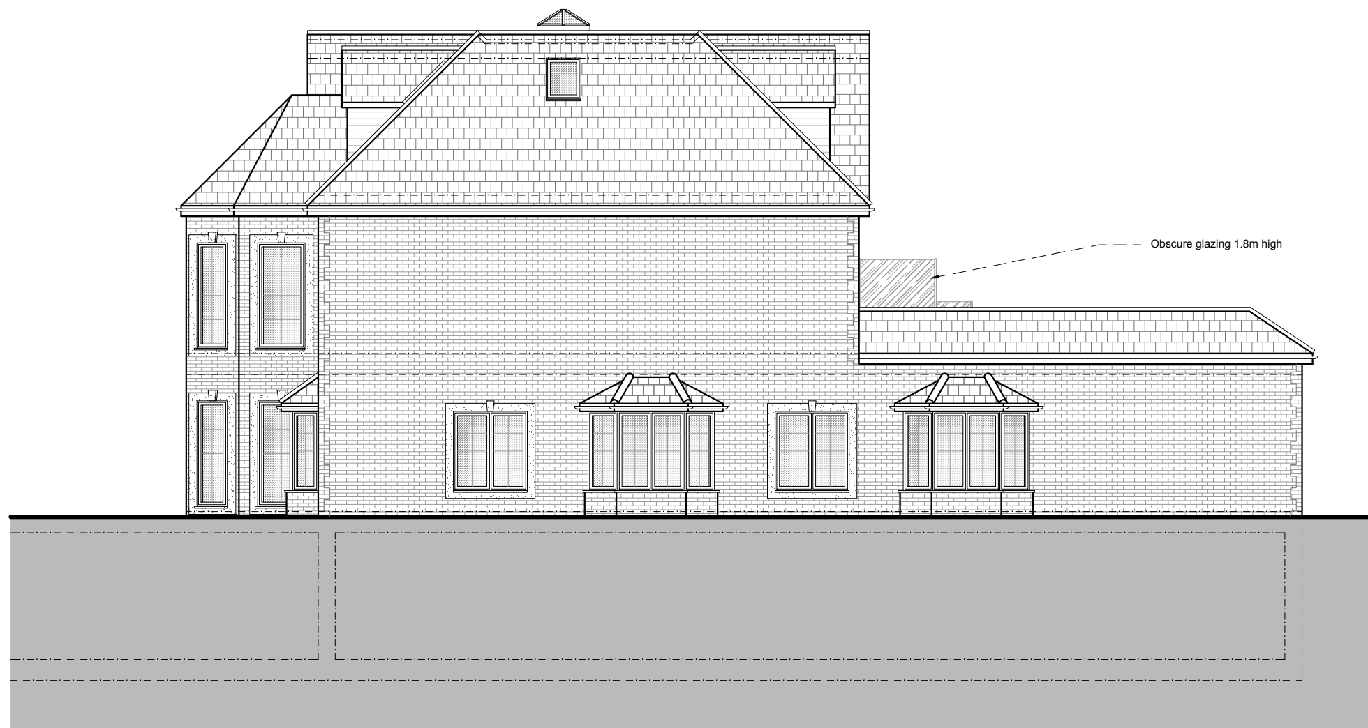
Side Elevation As Proposed - Scale 1:100