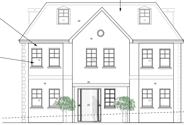
FRONT ELEVATION (NTS )

Proposed Windows Upvc , sash openable windows