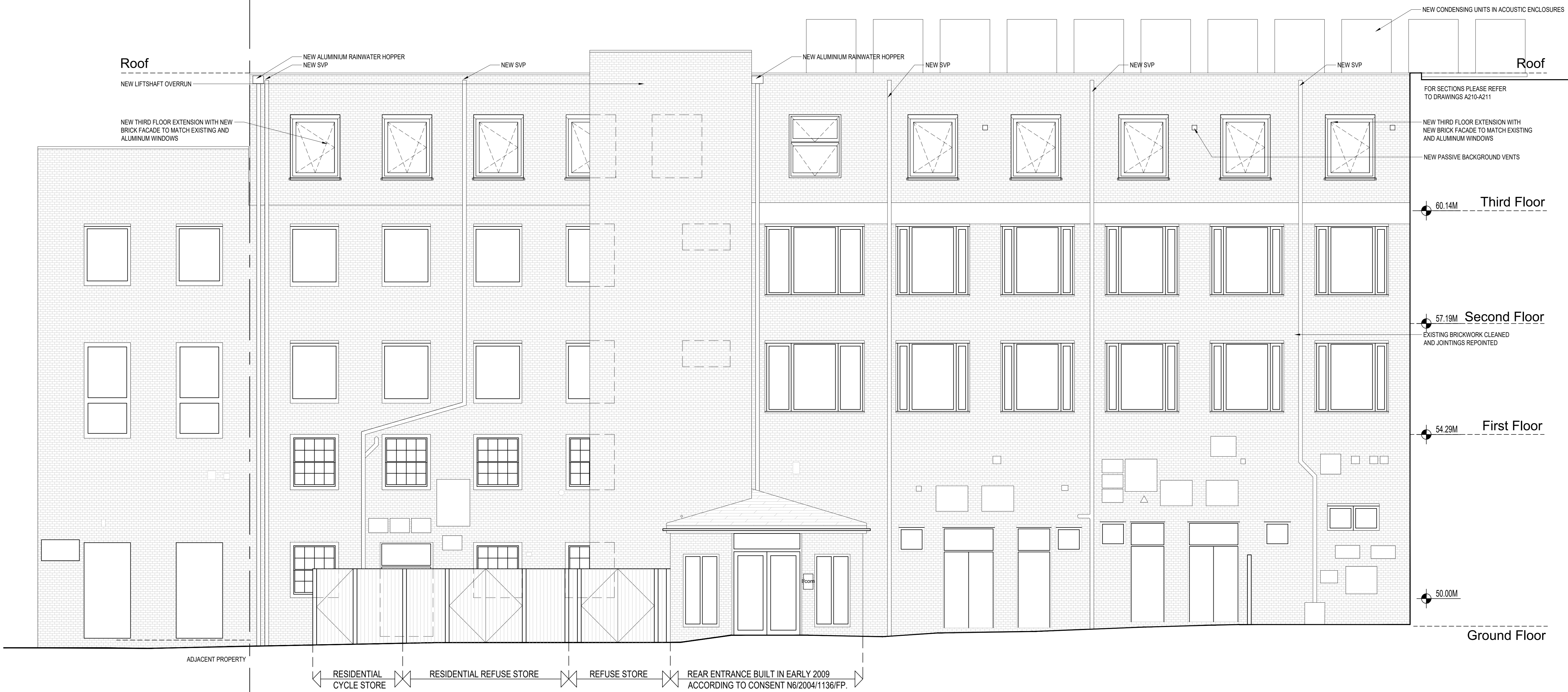
NORTH ELEVATION SCALE: 1:50 @ A0

RESIDENTIAL CYCLE STORE RESIDENTIAL REFUSE STORE REFUSE STORE REAR ENTRANCE BUILT IN EARLY 2009 ACCORDING TO CONSENT N6/2004/1136/FP.