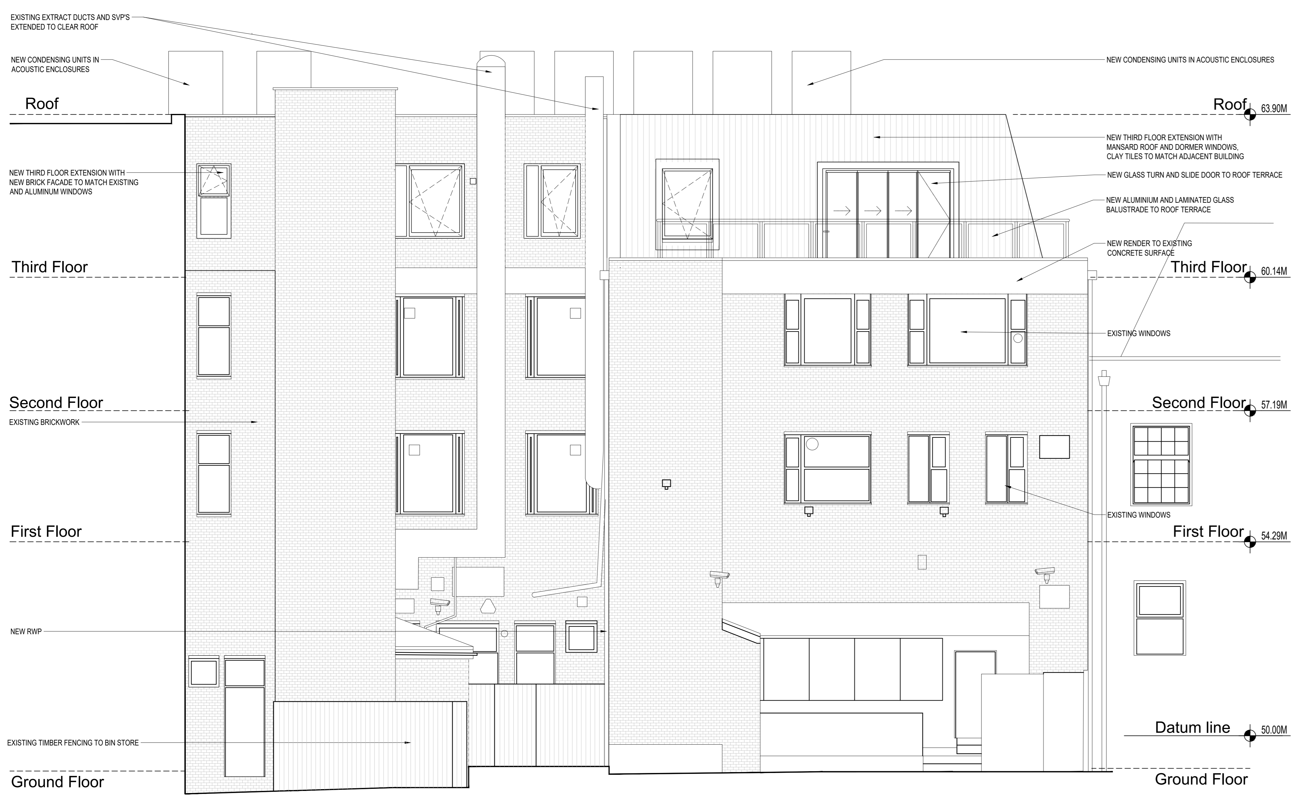
EAST ELEVATION SCALE: 1:50 @ A0

WELWYN AUTHORITY CONSIDERS THE WORKS UNLAWFUL BECAUSE PRE-COMMENCEMENT CONDITIONS WERE NOT DISCHARGED. THIS APPLICATION IS TO REGULARISE THESE WORKS.