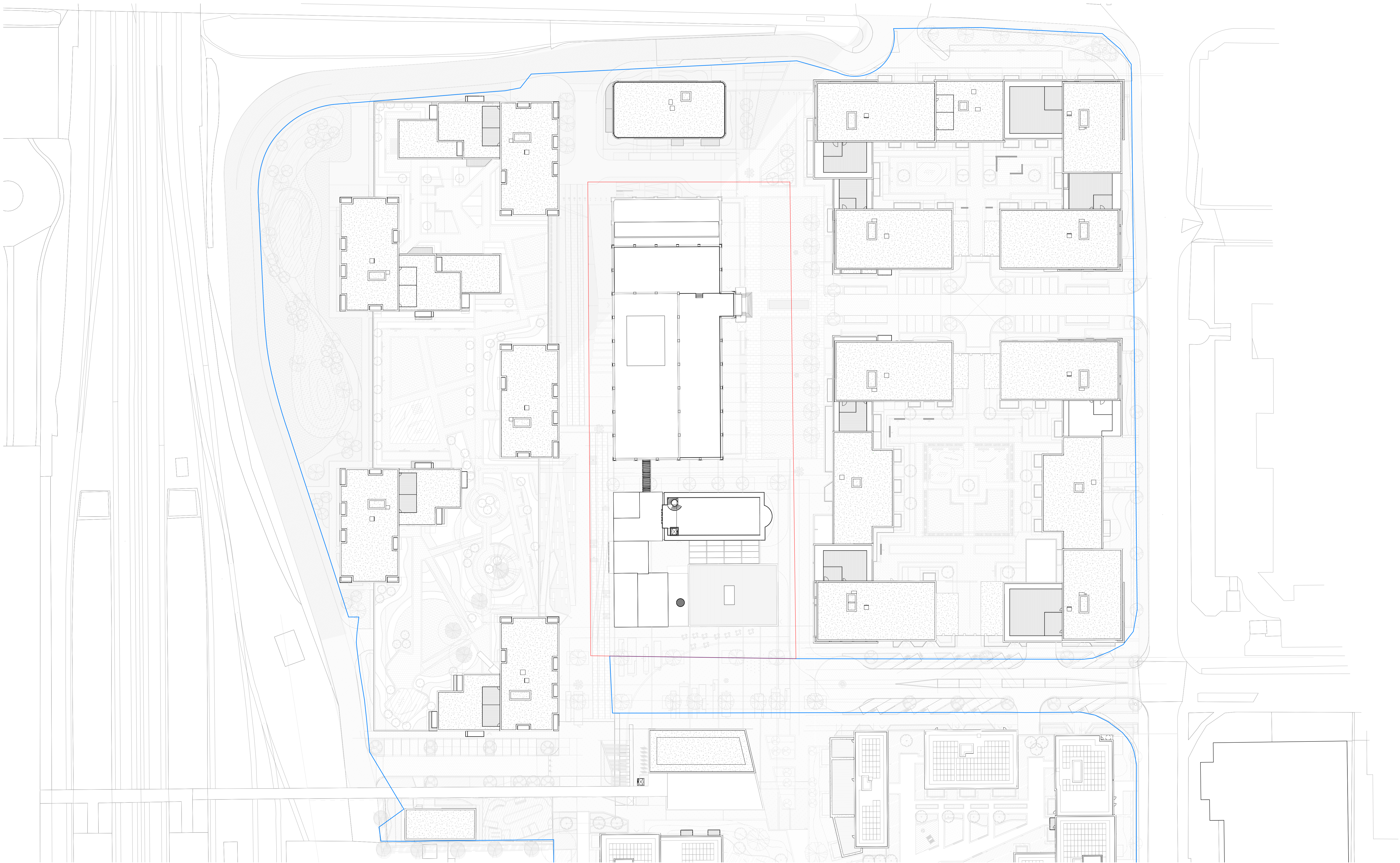
1 Site Location Plan 1 : 500 @A1