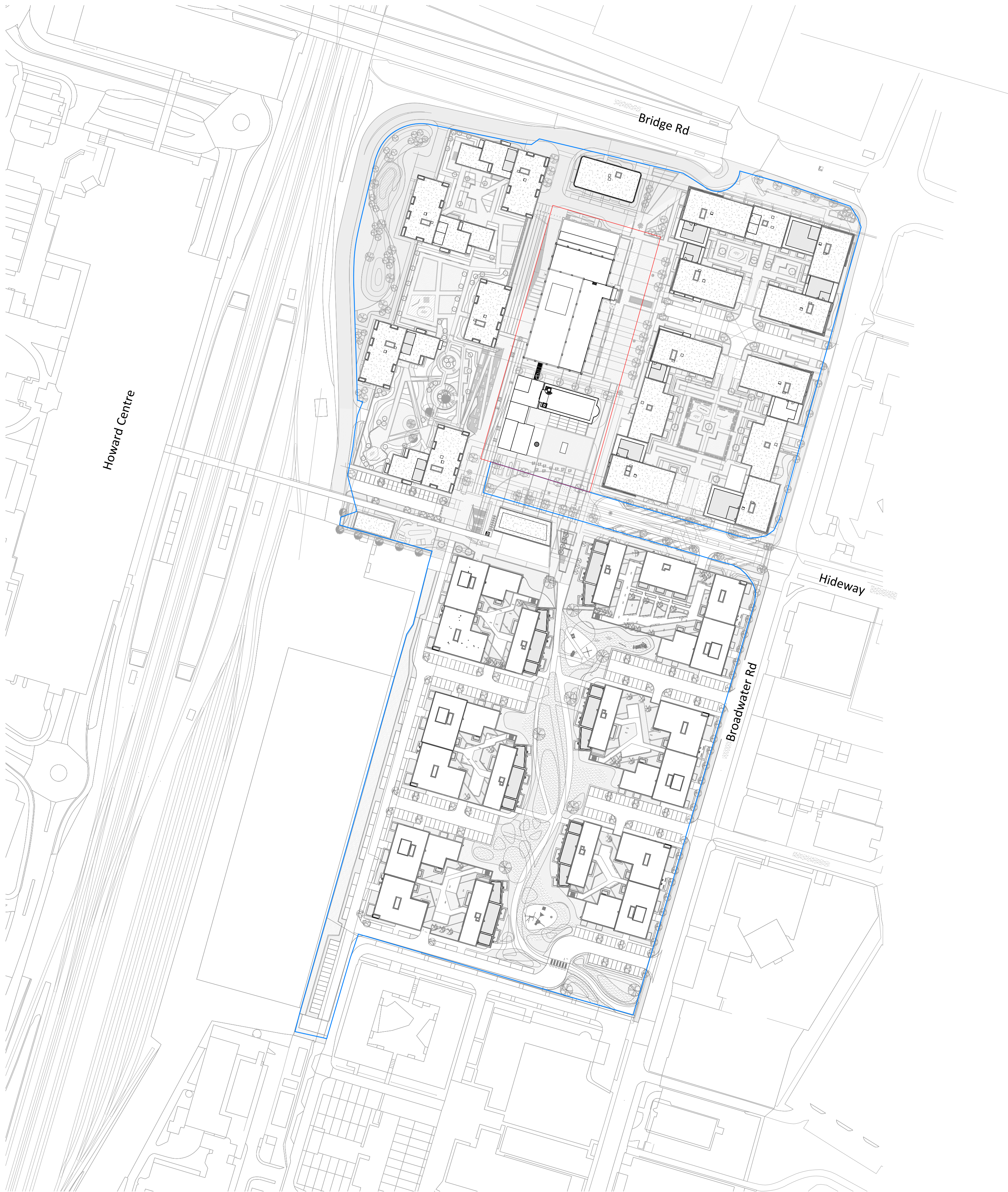
1 Site Location Plan 1 : 1250 @A1