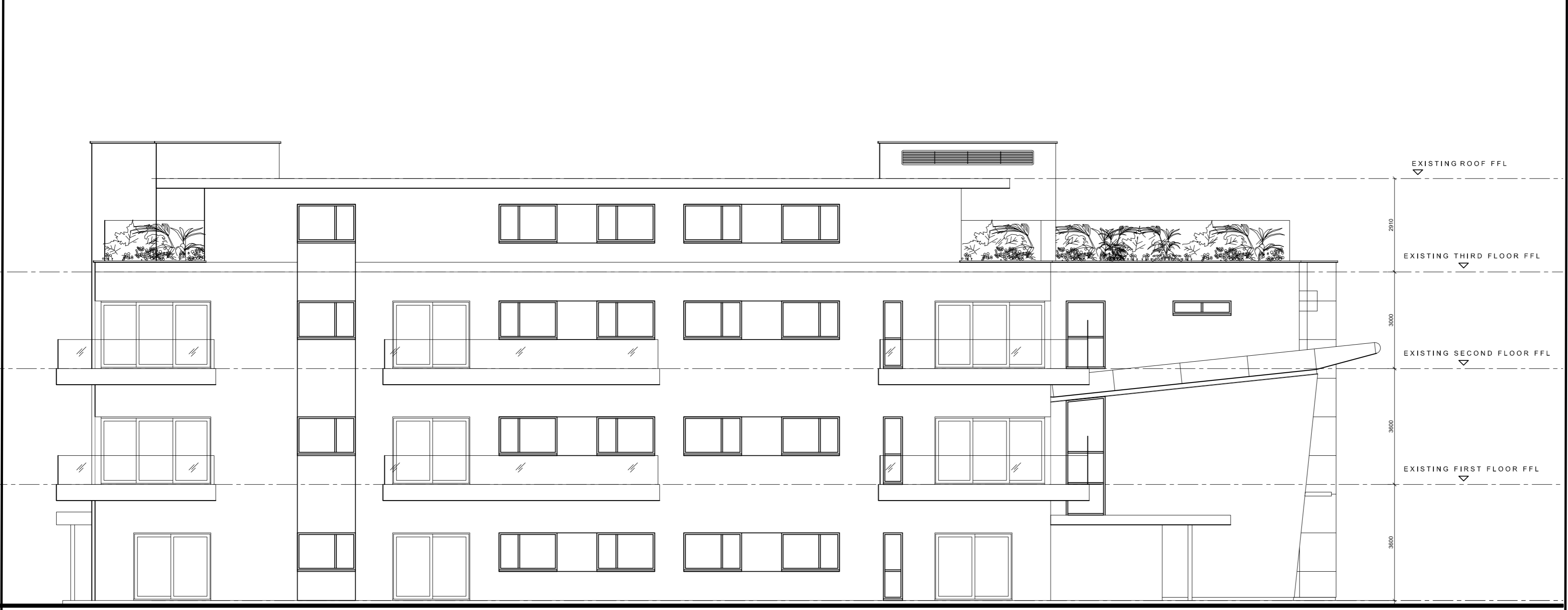
North Elevation (Planning Ref 6.2016/2497/MAJ)