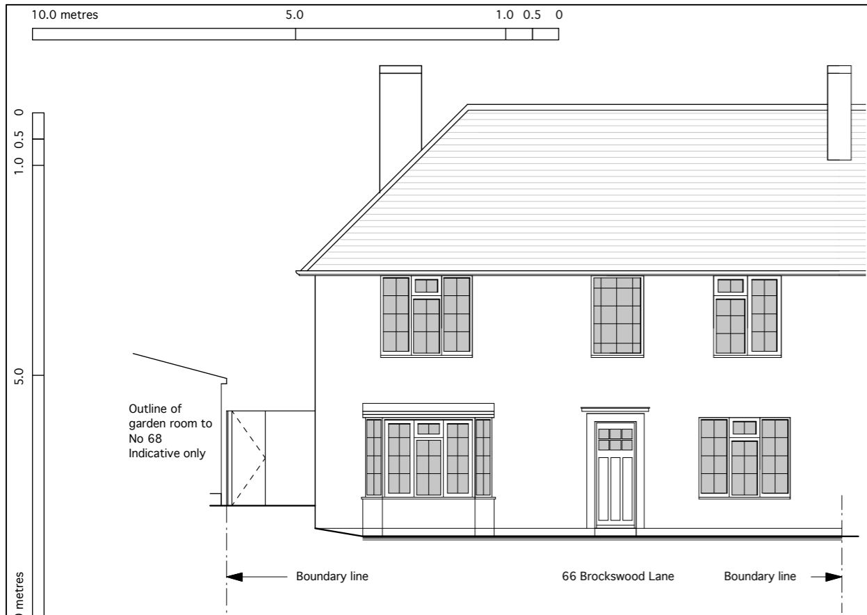
1 66 Brockwood Lane Front Elevation 1:100