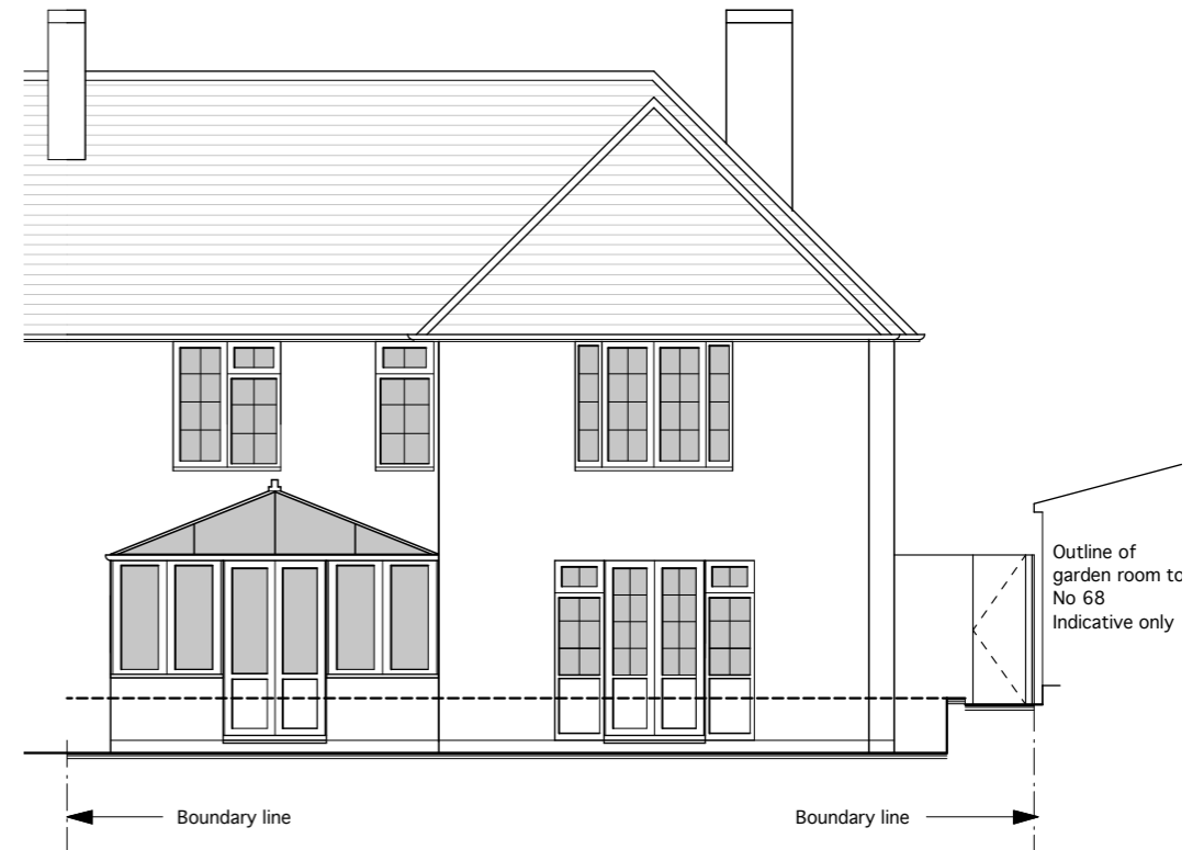
4 66 Brockwood Lane Rear / Garden Elevation 1:100