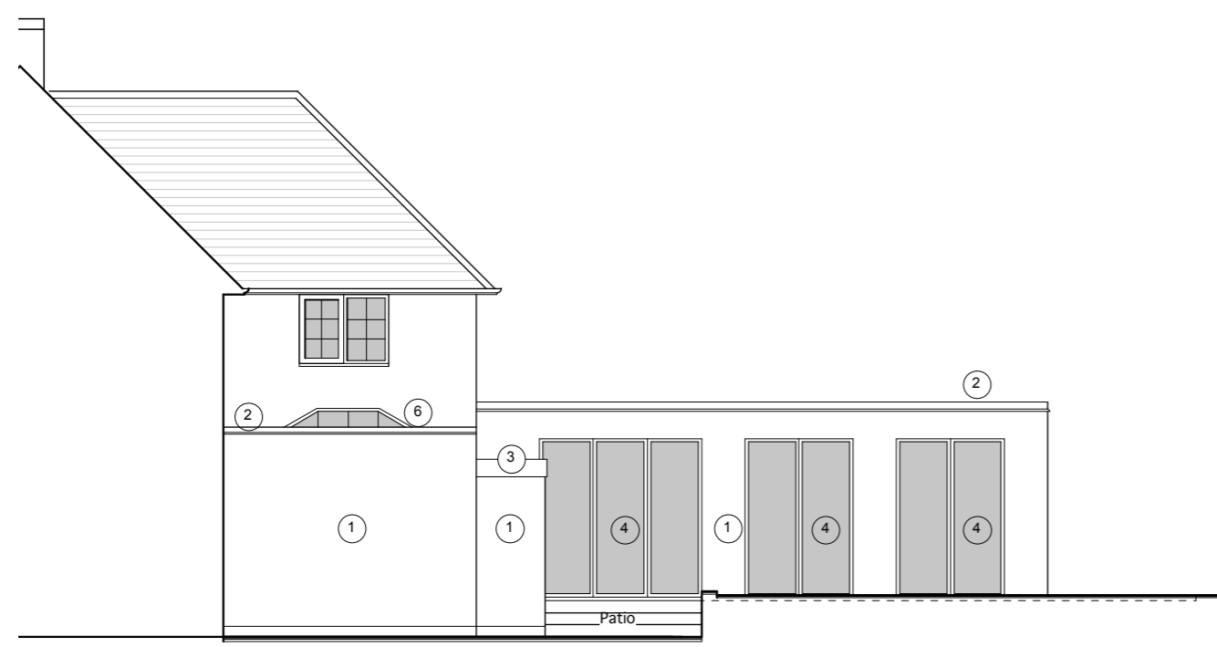
3 66 Brockwood Lane Side / East Elevation 1:100