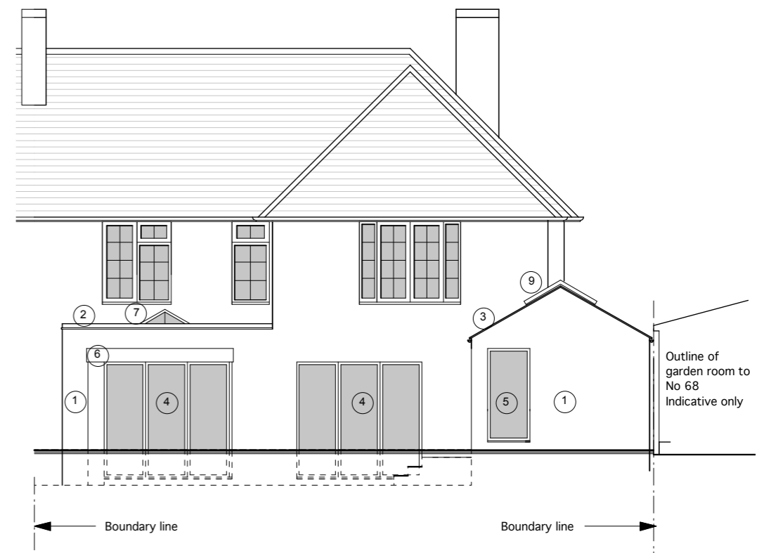
4 66 Brockwood Lane Rear / Garden Elevation 1:100