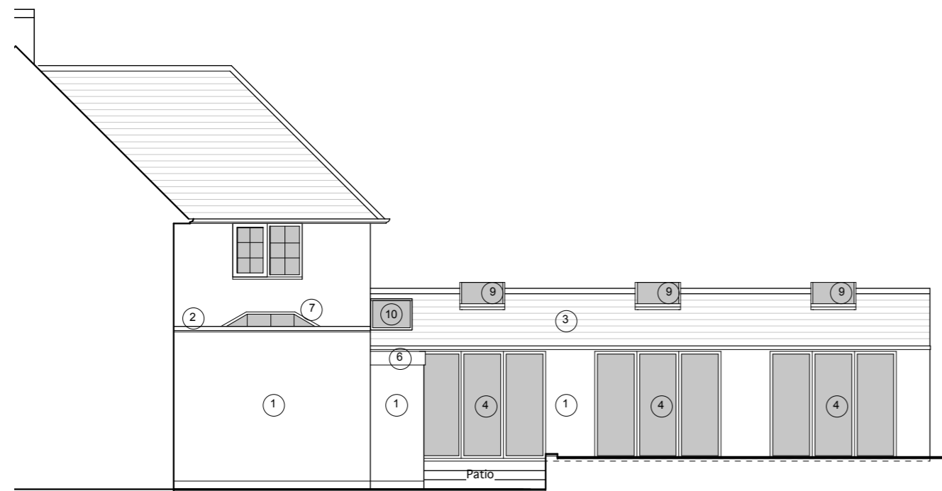
3 66 Brockwood Lane Side / East Elevation 1:100