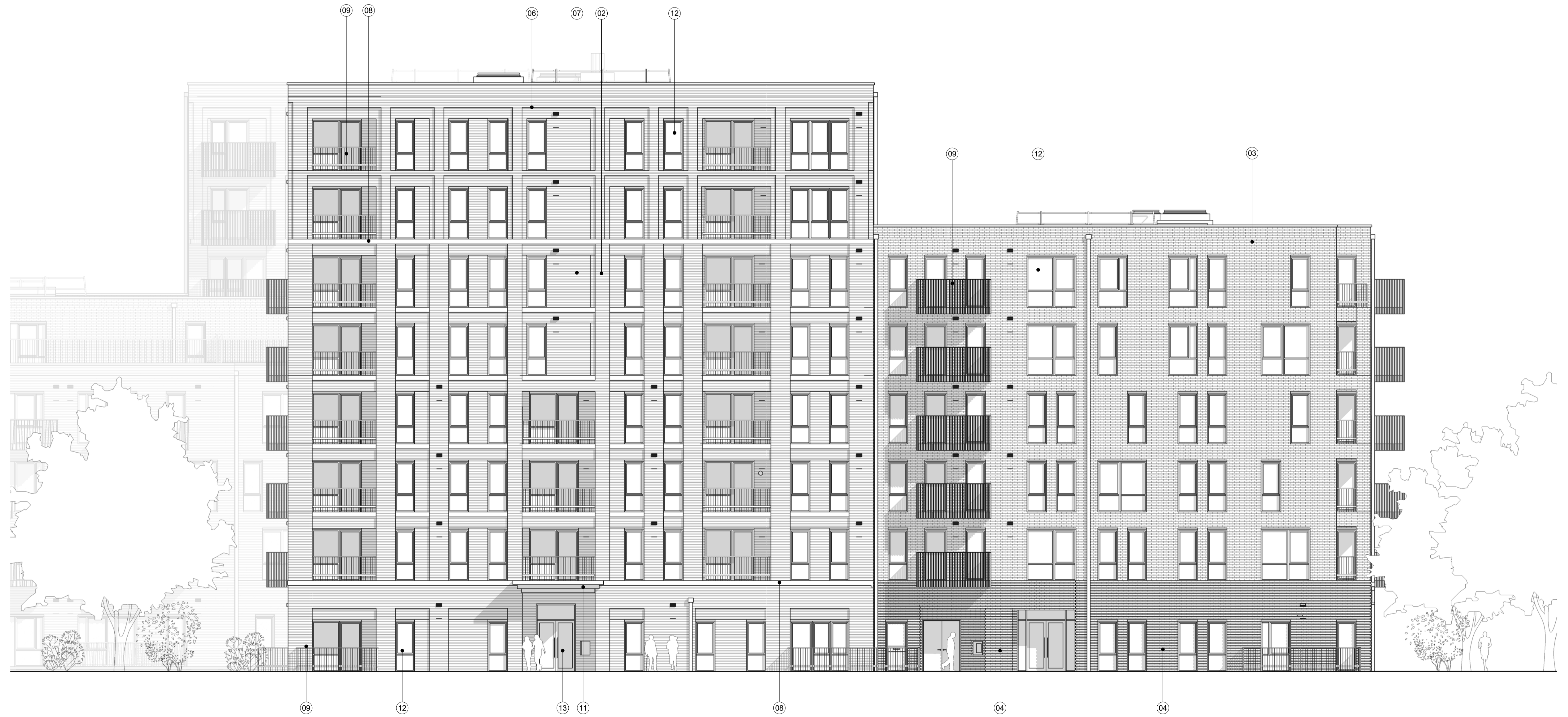
1 P3(S) - East Elevation - Block 10 1 : 100 @A1

NOTES CONSULTANTS - Refer to highways consultant's drawings for details - Refer to landscape consultant's drawings for details - Landscaping layout is indicative only AREAS - Refer to area schedule © Copyright Reserved. ColladoCollins Partners LLP