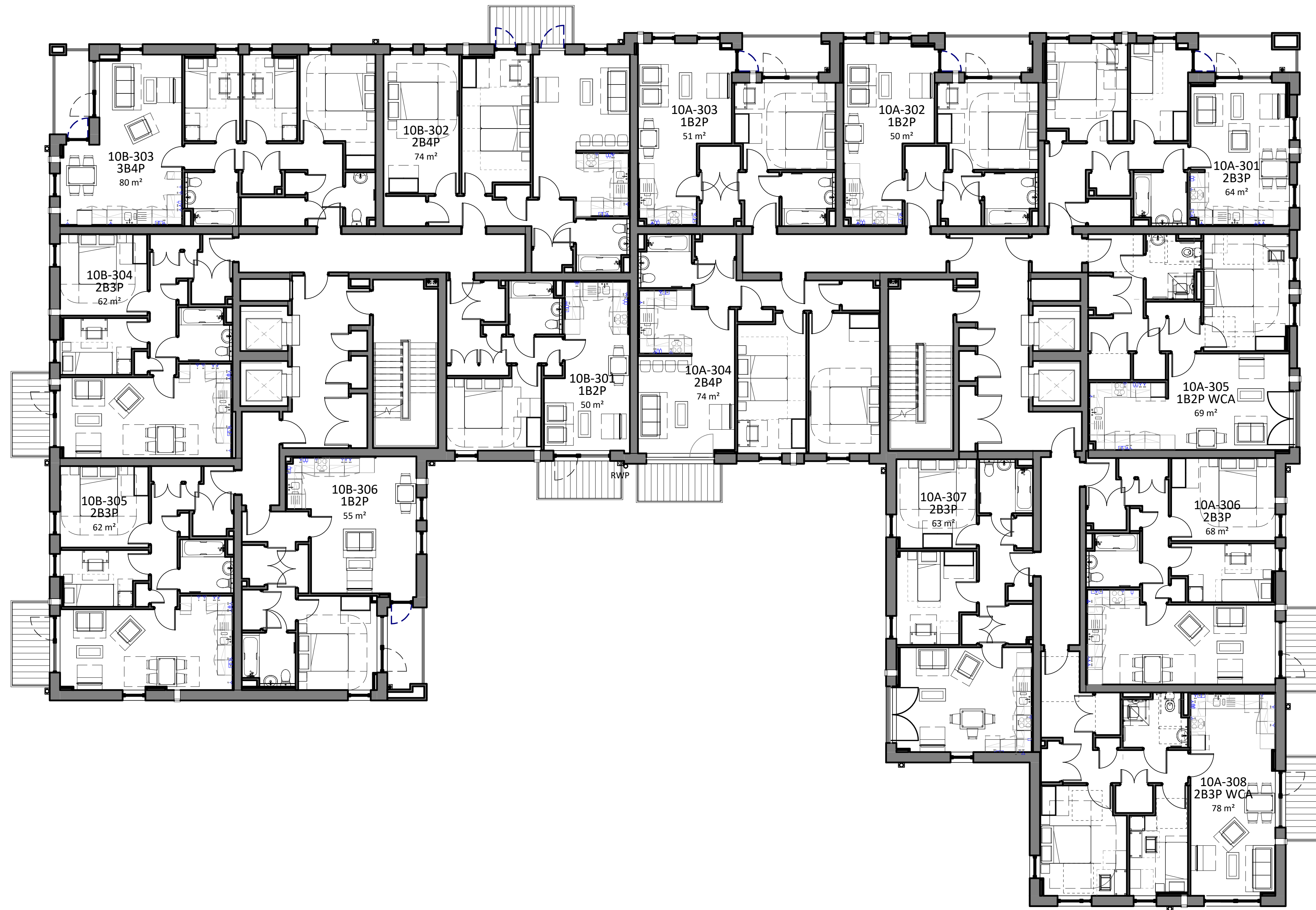
1 Block 11 - Typical Floor Plan - Floors 2 & 3 - Affordable 1 : 100 @A1

NOTES CONSULTANTS - Refer to highways consultant's drawings for details - Refer to landscape consultant's drawings for details - Landscaping layout is indicative only AREAS - Refer to area schedule © Copyright Reserved. ColladoCollins Partners LLP