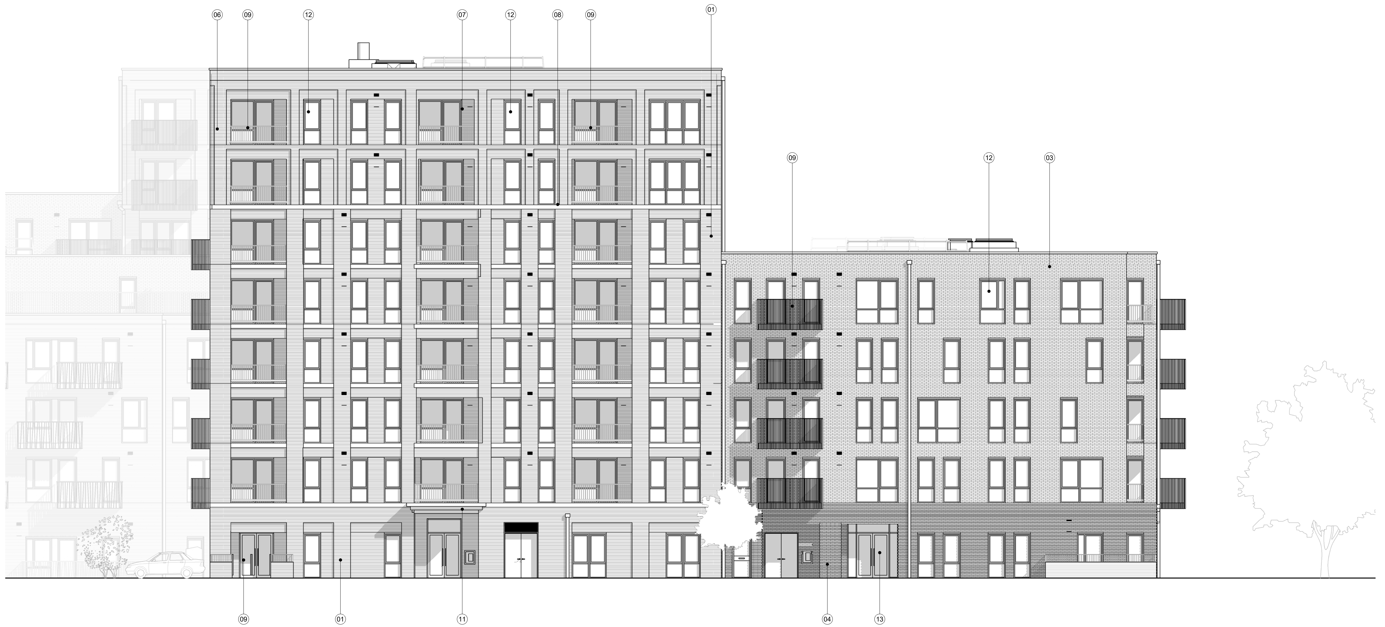
1 P3(S) - West Elevation C - Block 11 1 : 100 @A1

NOTES CONSULTANTS - Refer to highways consultant's drawings for details - Refer to landscape consultant's drawings for details - Landscaping layout is indicative only AREAS - Refer to area schedule © Copyright Reserved. ColladoCollins Partners LLP