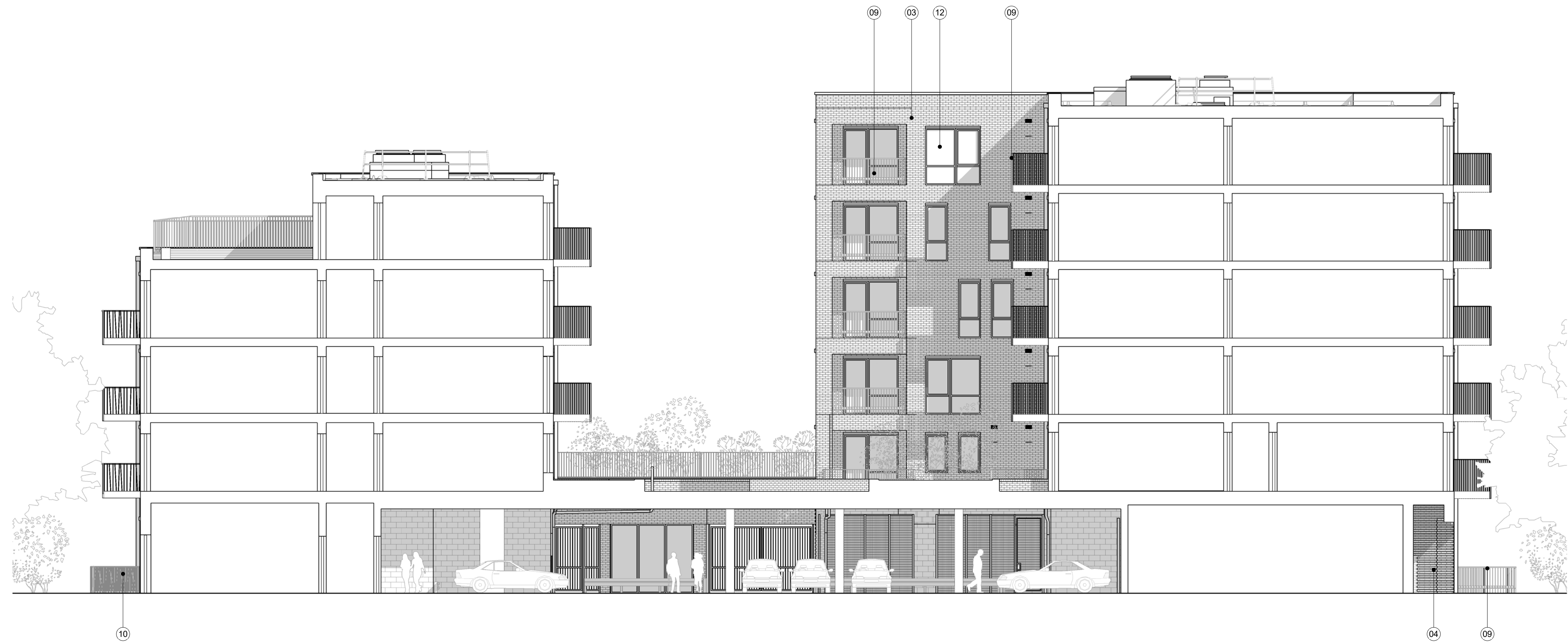
1 P3(S) - South Section - Block 10 1:100 @A1

NOTES CONSULTANTS - Refer to highways consultant's drawings for details - Refer to landscape consultant's drawings for details - Landscaping layout is indicative only AREAS - Refer to area schedule © Copyright Reserved. ColladoCollins Partners LLP