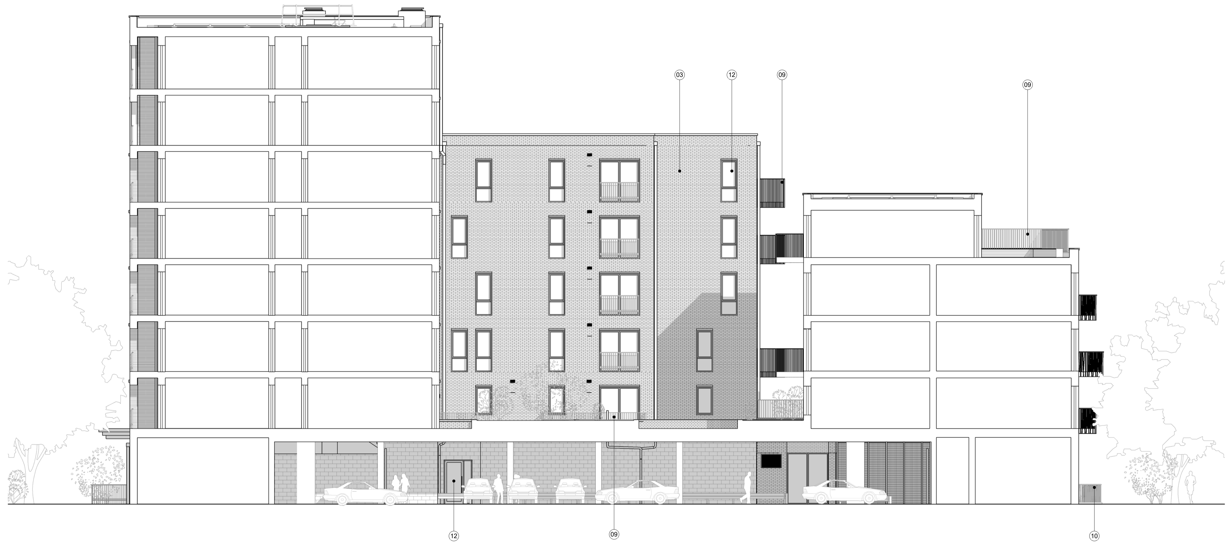
1 P3(S) - North Section - Block 10 1 : 100 @A1

NOTES CONSULTANTS - Refer to highways consultant's drawings for details - Refer to landscape consultant's drawings for details - Landscaping layout is indicative only AREAS - Refer to area schedule © Copyright Reserved. ColladoCollins Partners LLP