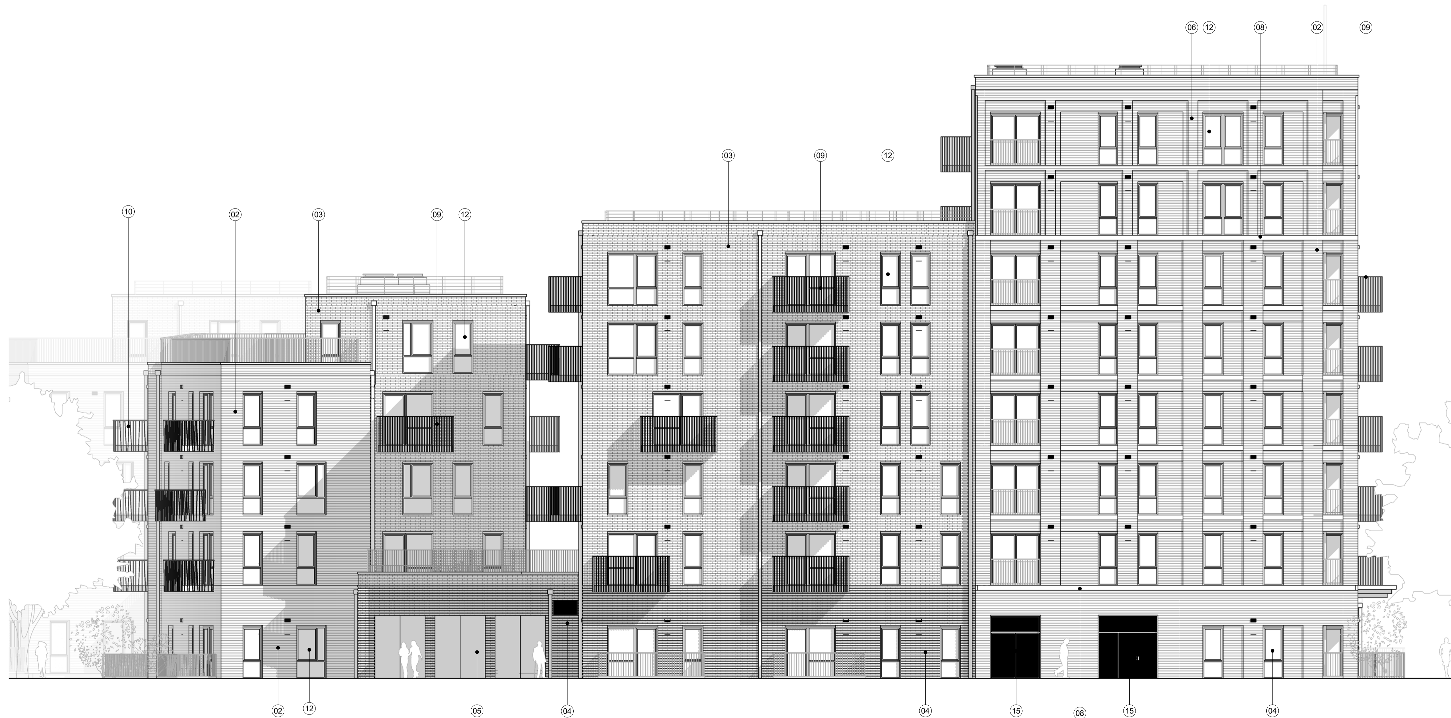
1 P3(S) - South Elevation - Block 10 1 : 100 @A1

NOTES CONSULTANTS - Refer to highways consultant's drawings for details - Refer to landscape consultant's drawings for details - Landscaping layout is indicative only AREAS - Refer to area schedule © Copyright Reserved. ColladoCollins Partners LLP