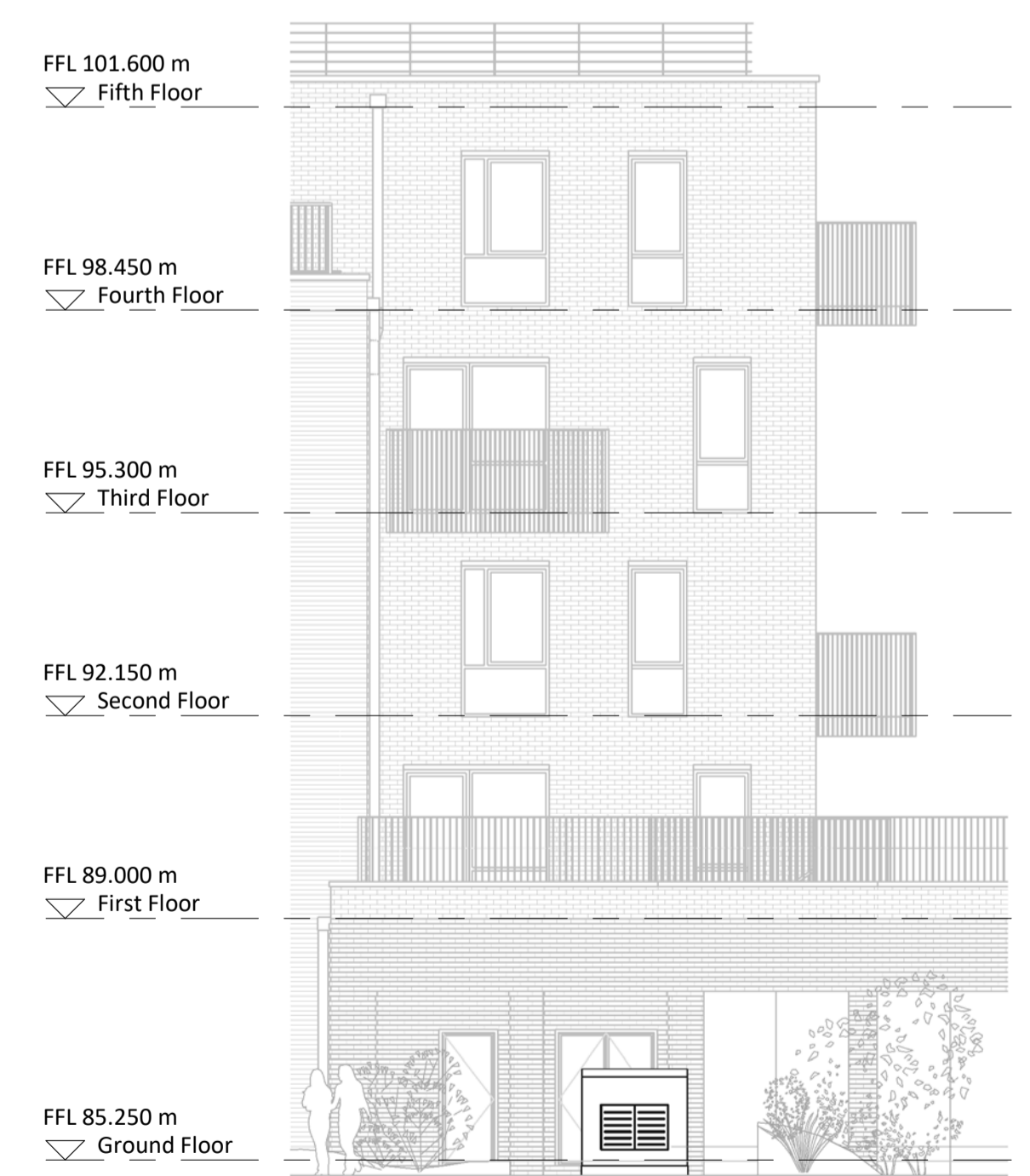
3 Block 11 Gas Meter Front Elevation