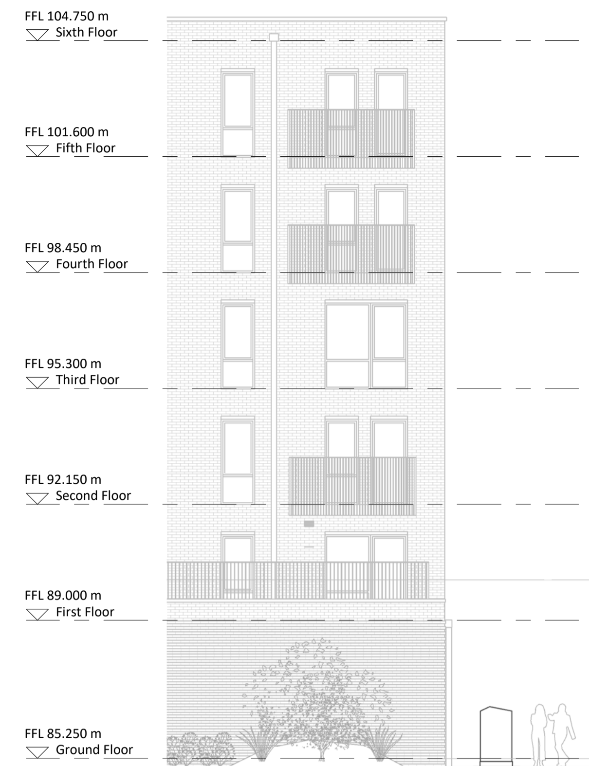
2 Block 11 Gas Meter Side Elevation