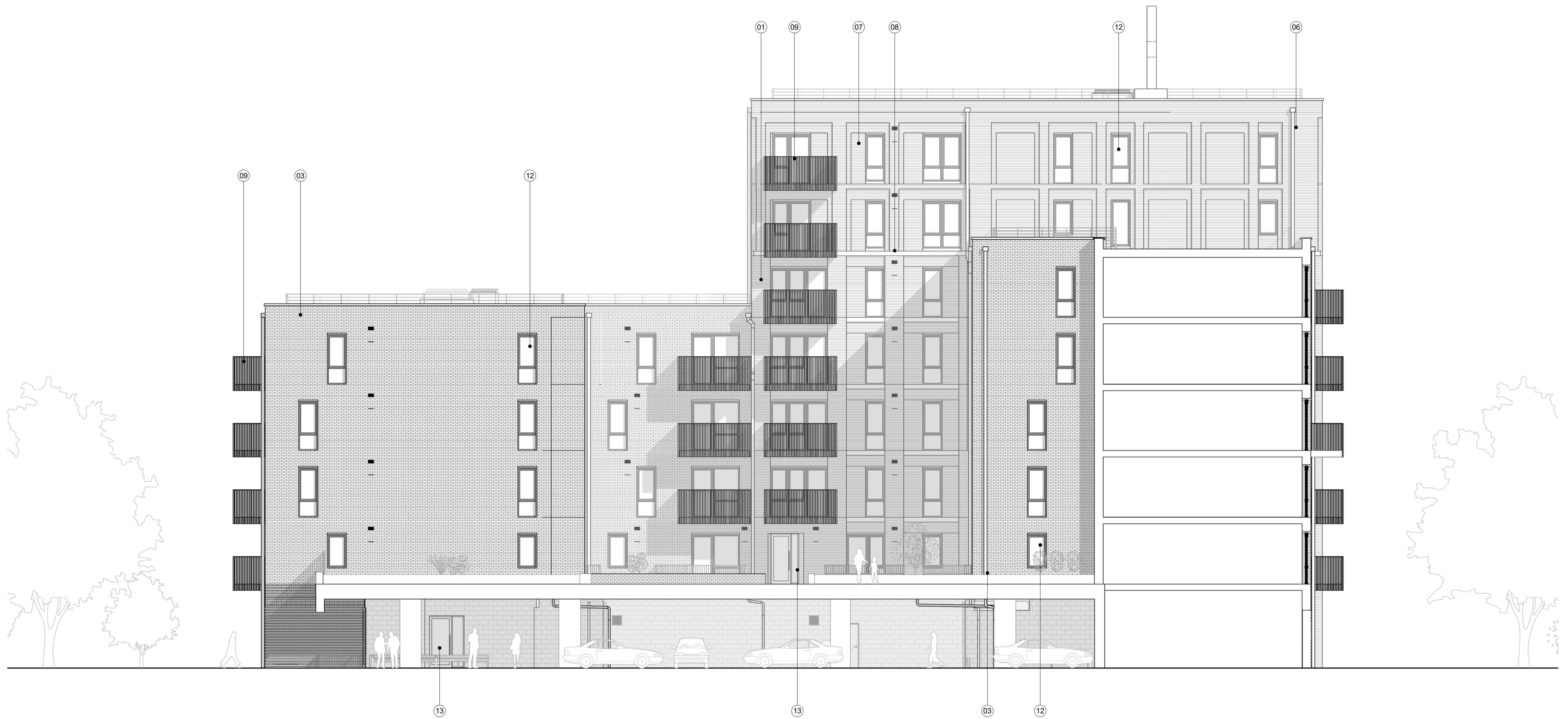
1 P3(S) - East Section F - Block 11 1 : 100 @A1

NOTES CONSULTANTS - Refer to highways consultant's drawings for details - Refer to landscape consultant's drawings for details - Landscaping layout is indicative only AREAS - Refer to area schedule © Copyright Reserved. ColladoCollins Partners LLP