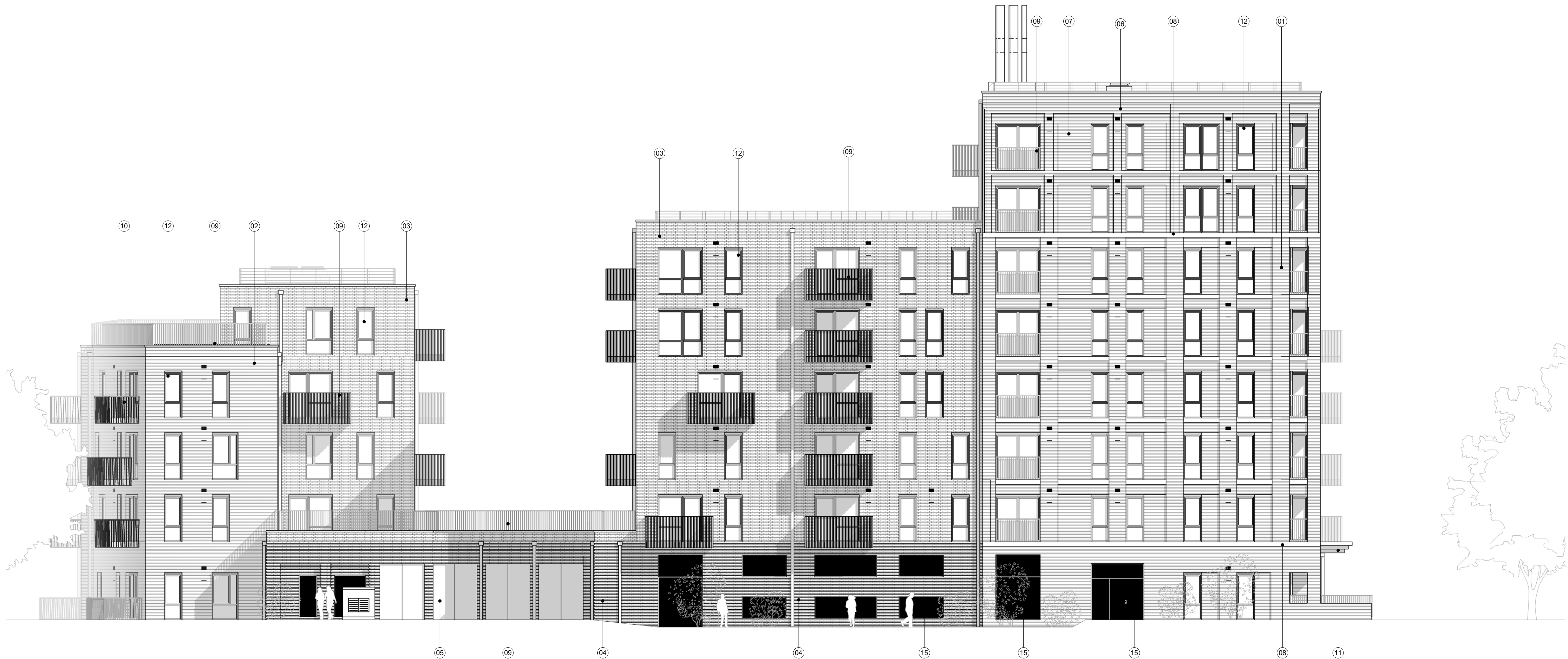
1 P3(S) - North Elevation B - Block 11 1 : 100 @A1

NOTES CONSULTANTS - Refer to highways consultant's drawings for details - Refer to landscape consultant's drawings for details - Landscaping layout is indicative only AREAS - Refer to area schedule © Copyright Reserved. ColladoCollins Partners LLP