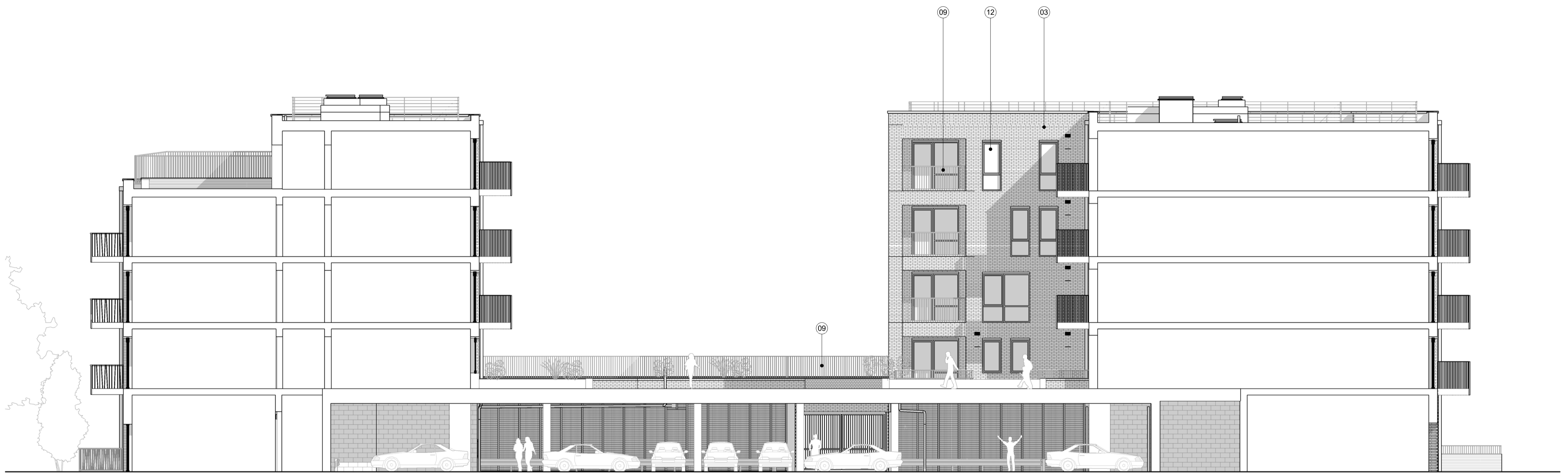
1 P3(S) - North Section D - Block 11 1 : 100 @A1

NOTES CONSULTANTS - Refer to highways consultant's drawings for details - Refer to landscape consultant's drawings for details - Landscaping layout is indicative only AREAS - Refer to area schedule © Copyright Reserved. ColladoCollins Partners LLP