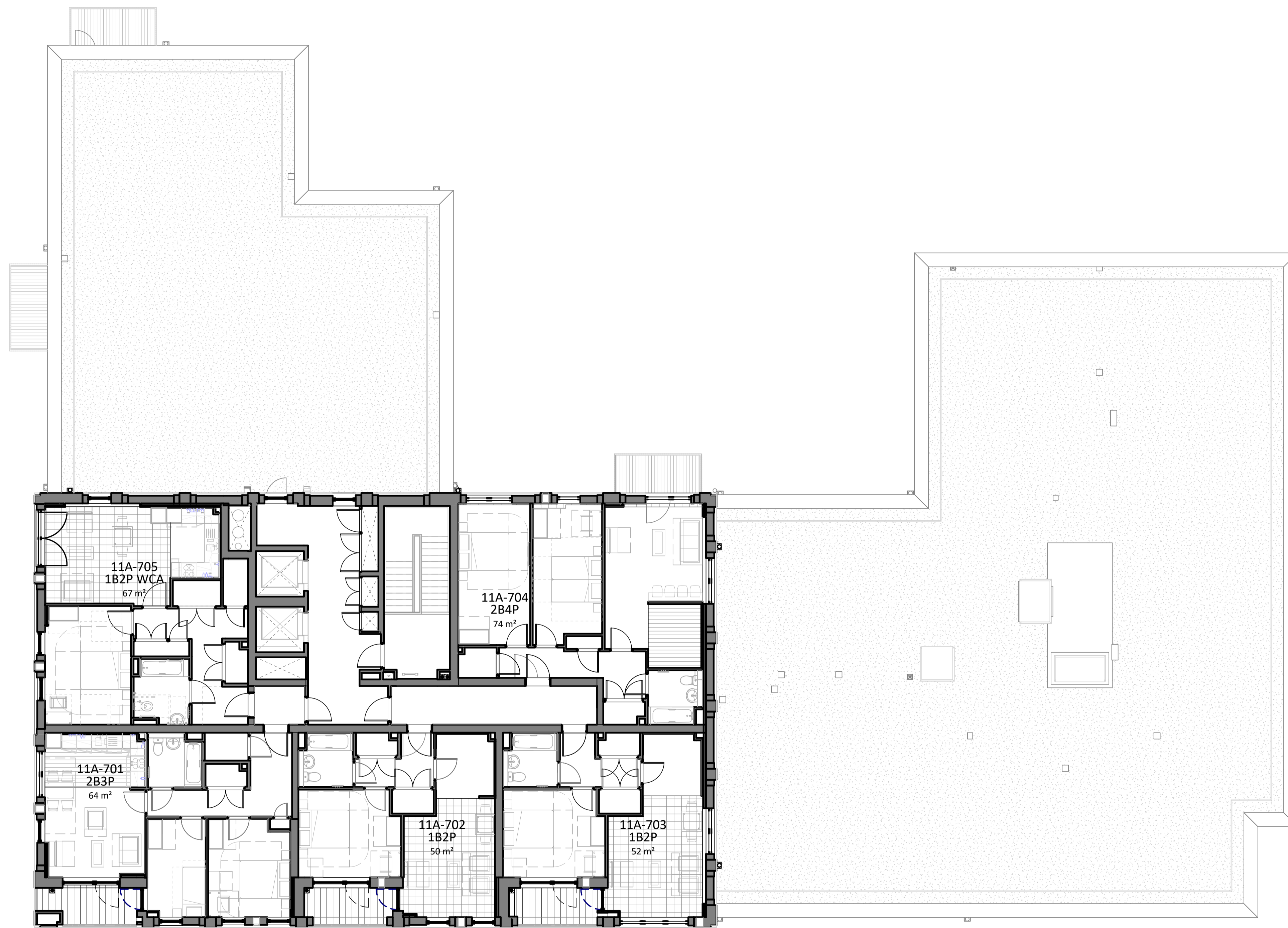
1 Block 11 - Top Floor Plan - Affordable 1:100 @A1

NOTES CONSULTANTS - Refer to highways consultant's drawings for details - Refer to landscape consultant's drawings for details - Landscaping layout is indicative only AREAS - Refer to area schedule © Copyright Reserved. ColladoCollins Partners LLP