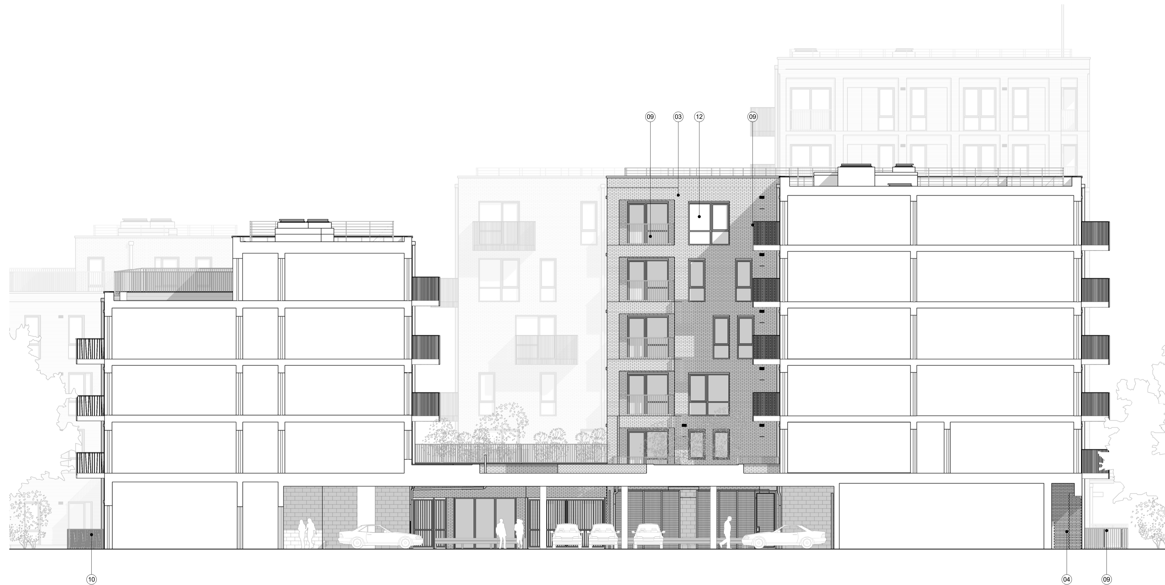
1 P3(S) - South Section - Block 10 1:100 @A1

NOTES CONSULTANTS - Refer to highways consultant's drawings for details - Refer to landscape consultant's drawings for details - Landscaping layout is indicative only AREAS - Refer to area schedule © Copyright Reserved. ColladoCollins Partners LLP