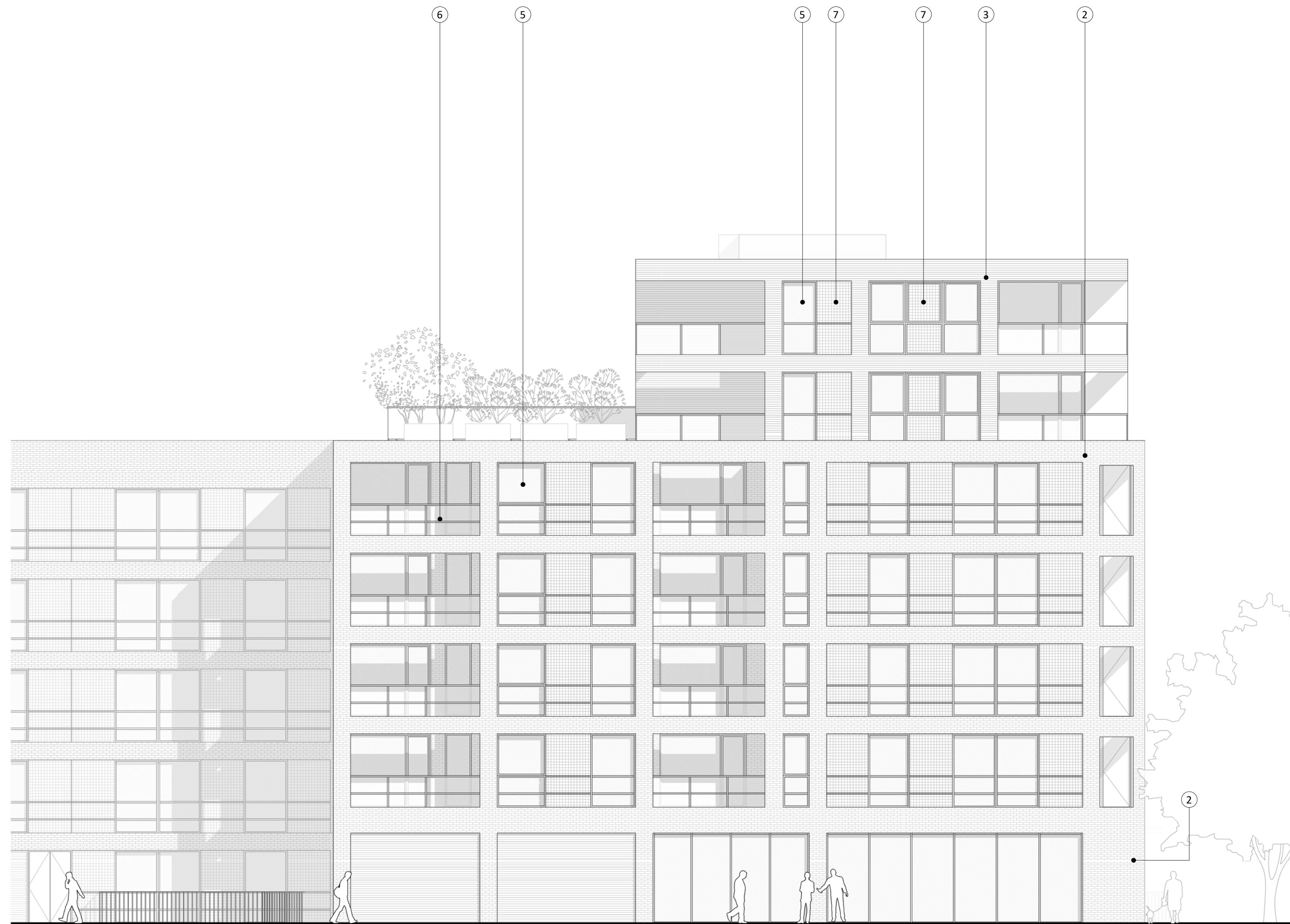
1 Block 07 (7F)-West Elevation 1 : 100 @A1

NOTES CONSULTANTS - Refer to highways consultant's drawings for details - Refer to landscape consultant's drawings for details - Landscaping layout is indicative only AREAS - Refer to area schedule © Copyright Reserved. ColladoCollins Partners LLP