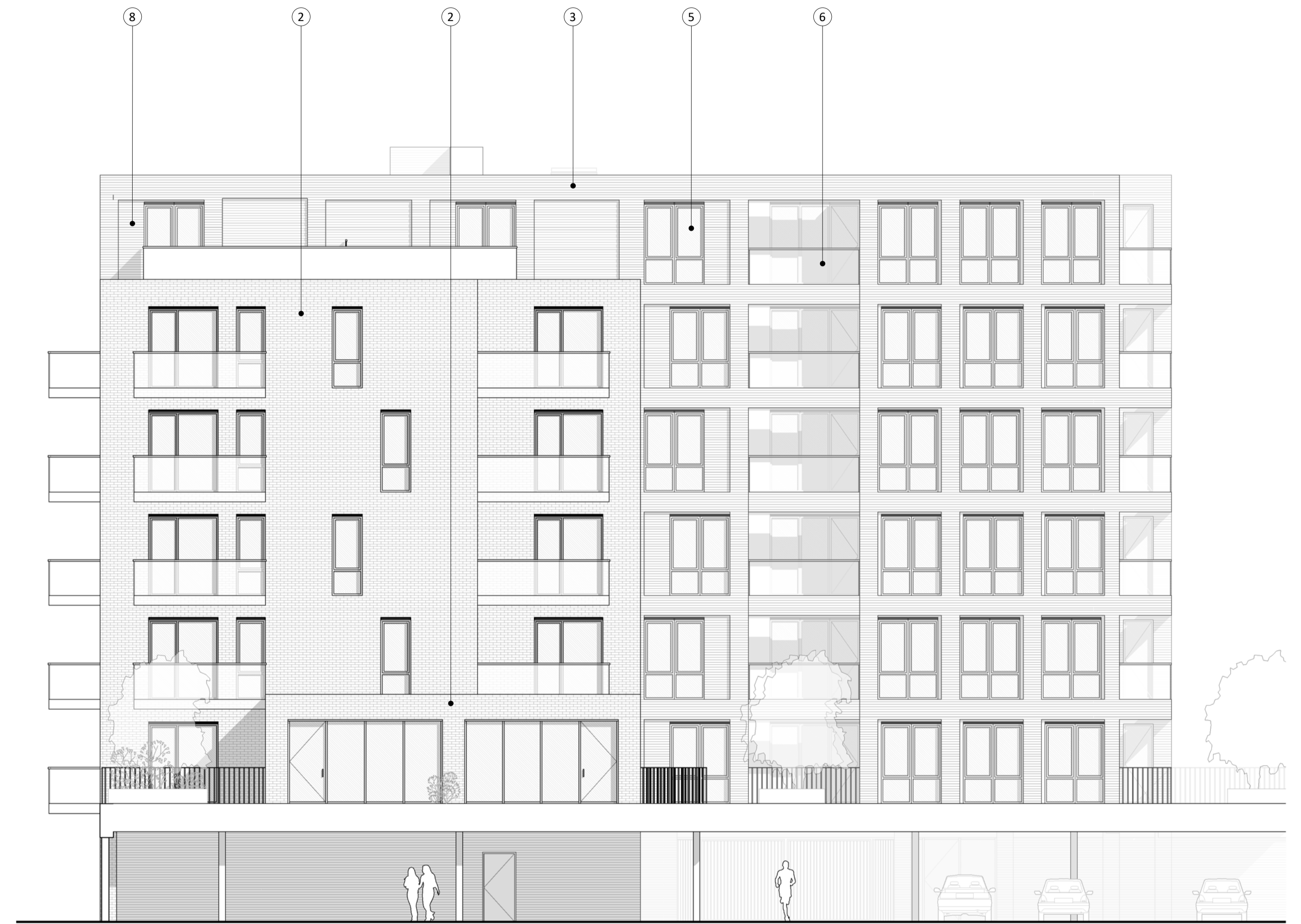
BLOCK 03 B