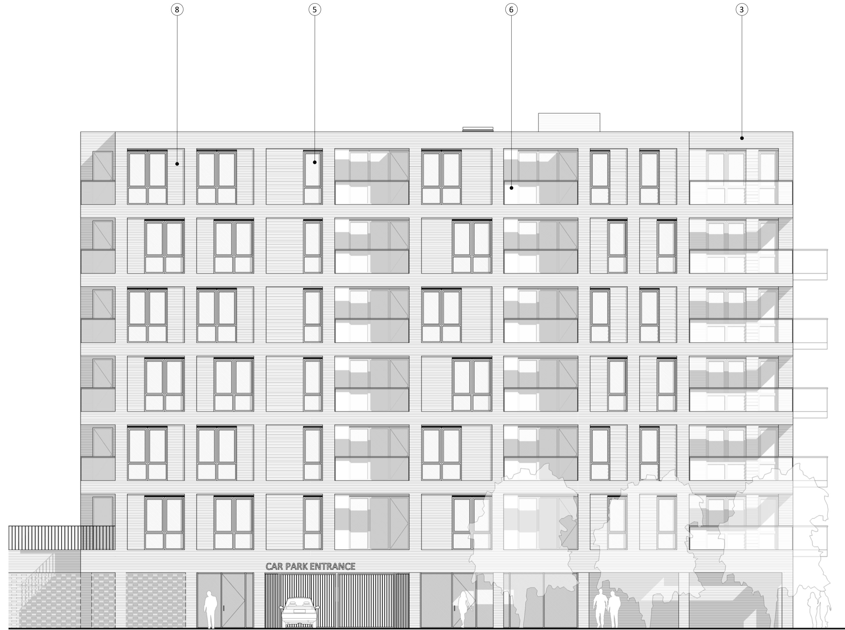
BLOCK 03 B