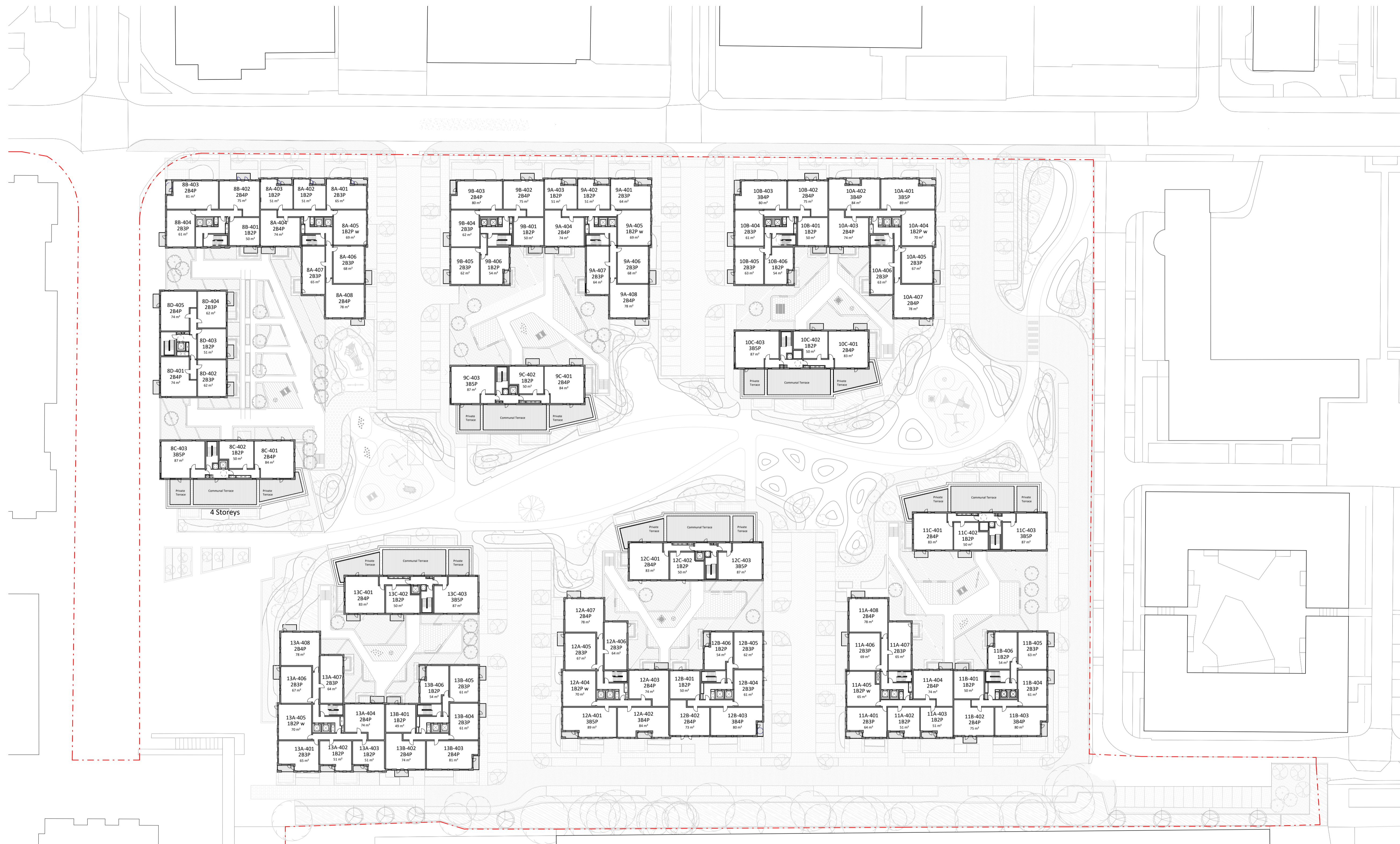
1 PO(S)-104 - Fourth Floor Plan 1 : 500 @A1

NOTES CONSULTANTS - Refer to highways consultant's drawings for details - Refer to landscape consultant's drawings for details - Landscaping layout is indicative only AREAS - Refer to area schedule © Copyright Reserved. ColladoCollins Partners LLP