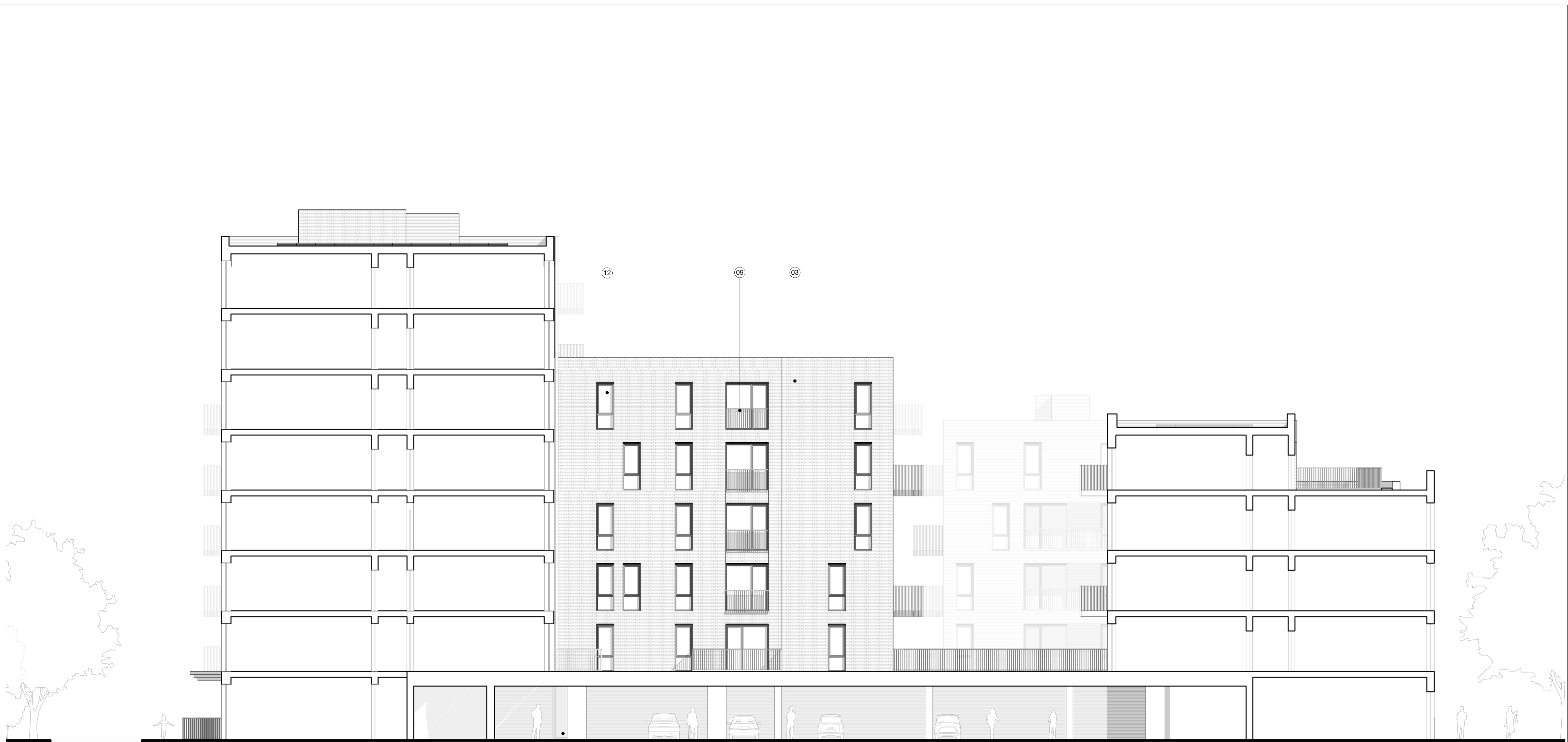
1 P3(S) - North Section D - Block 9 1 : 100 @A1

NOTES CONSULTANTS - Refer to highways consultant's drawings for details - Refer to landscape consultant's drawings for details - Landscaping layout is indicative only AREAS - Refer to area schedule © Copyright Reserved. ColladoCollins Partners LLP