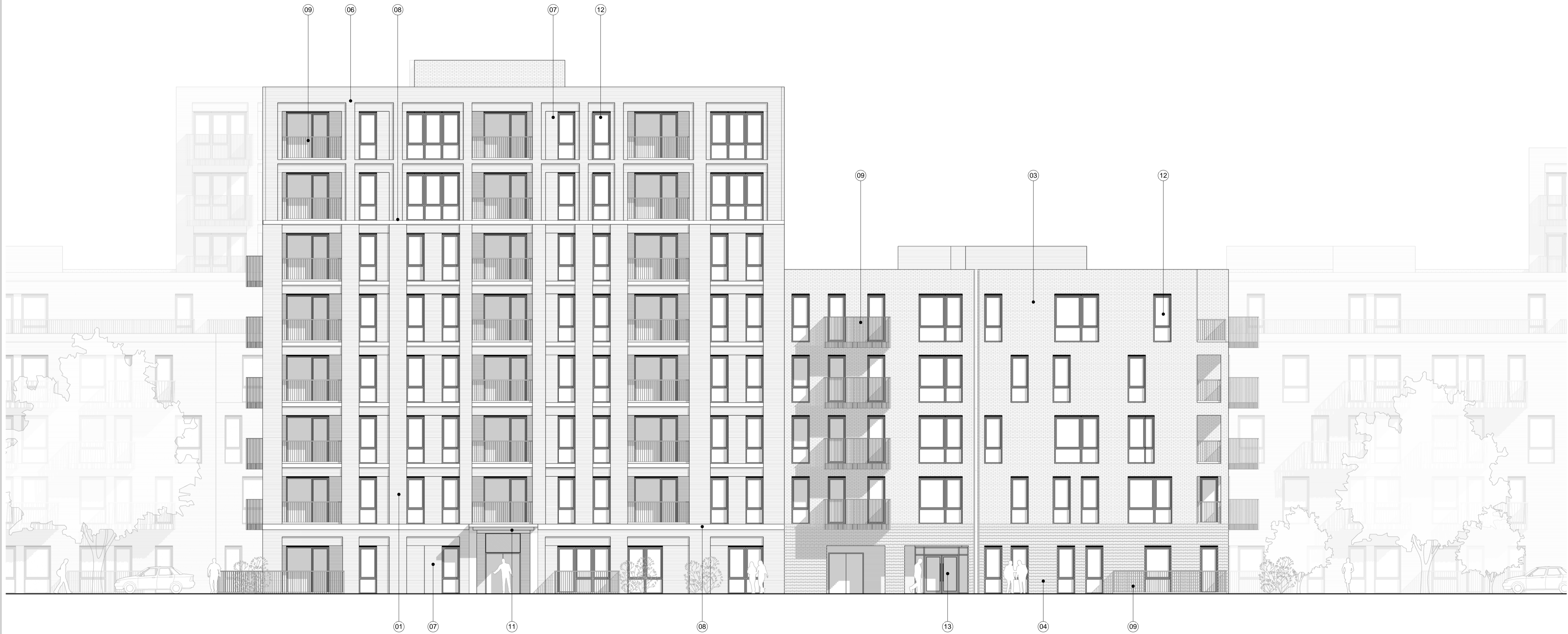
1 P3(S) - East Elevation A - Block 9 1 : 100 @A1

NOTES CONSULTANTS - Refer to highways consultant's drawings for details - Refer to landscape consultant's drawings for details - Landscaping layout is indicative only