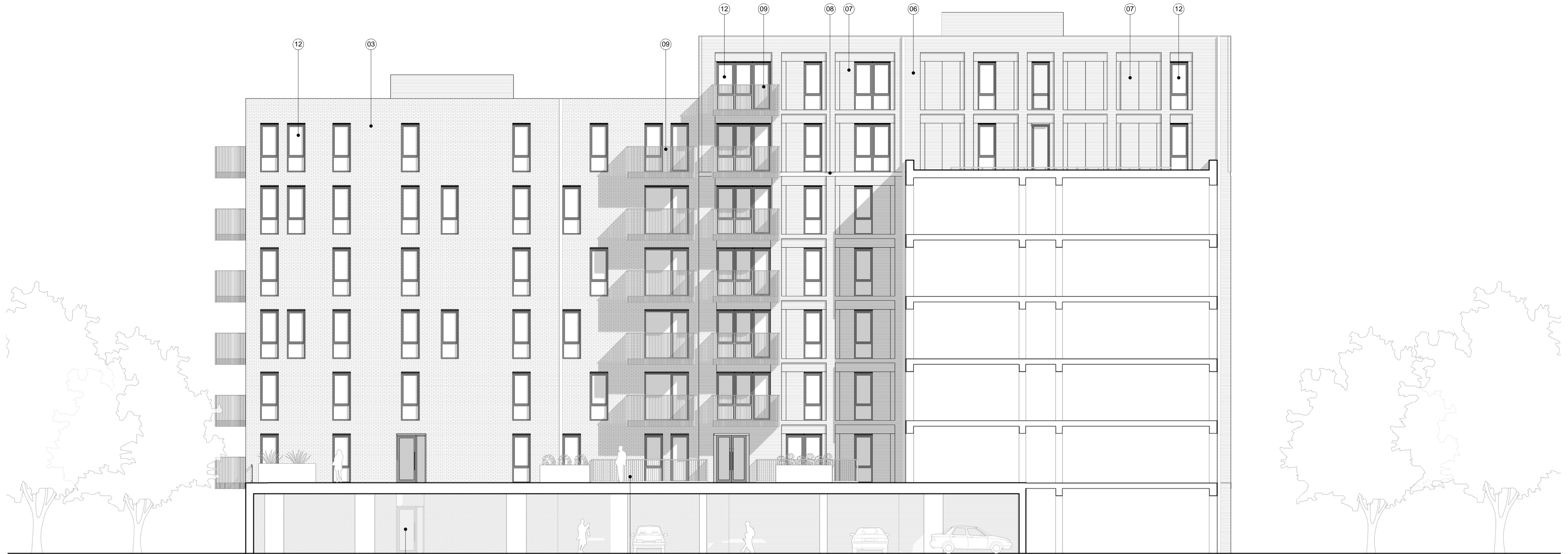
1 P3(S) - East Section G - Block 8 1 : 100 @A1