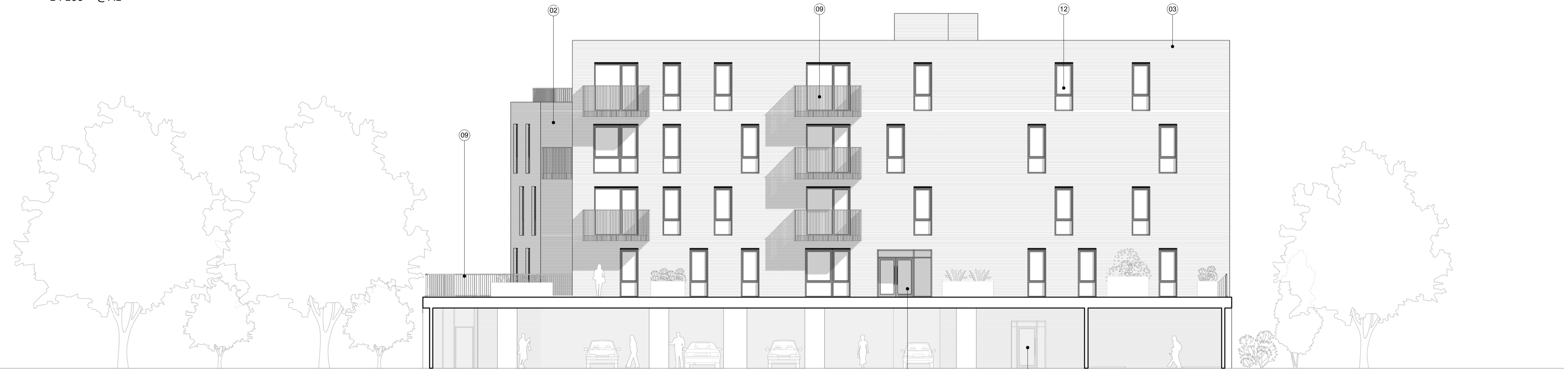
2 P3(S) - West Elevation H - Block 8 1 : 100 @A1

NOTES CONSULTANTS - Refer to highways consultant's drawings for details - Refer to landscape consultant's drawings for details - Landscaping layout is indicative only AREAS - Refer to area schedule © Copyright Reserved. ColladoCollins Partners LLP