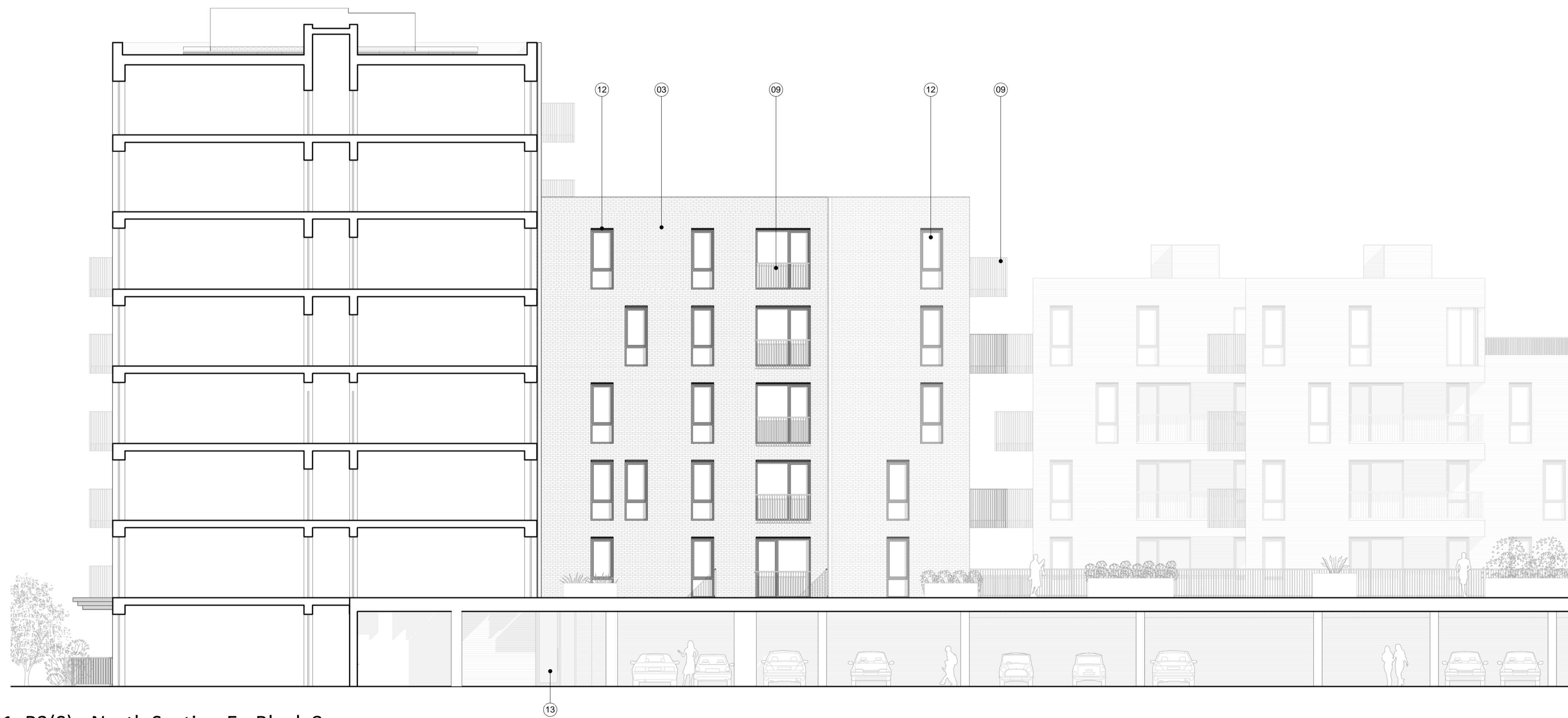
1 P3(S) - North Section E - Block 8 1:100 @A1

NOTES CONSULTANTS - Refer to highways consultant's drawings for details - Refer to landscape consultant's drawings for details - Landscaping layout is indicative only AREAS - Refer to area schedule © Copyright Reserved. ColladoCollins Partners LLP