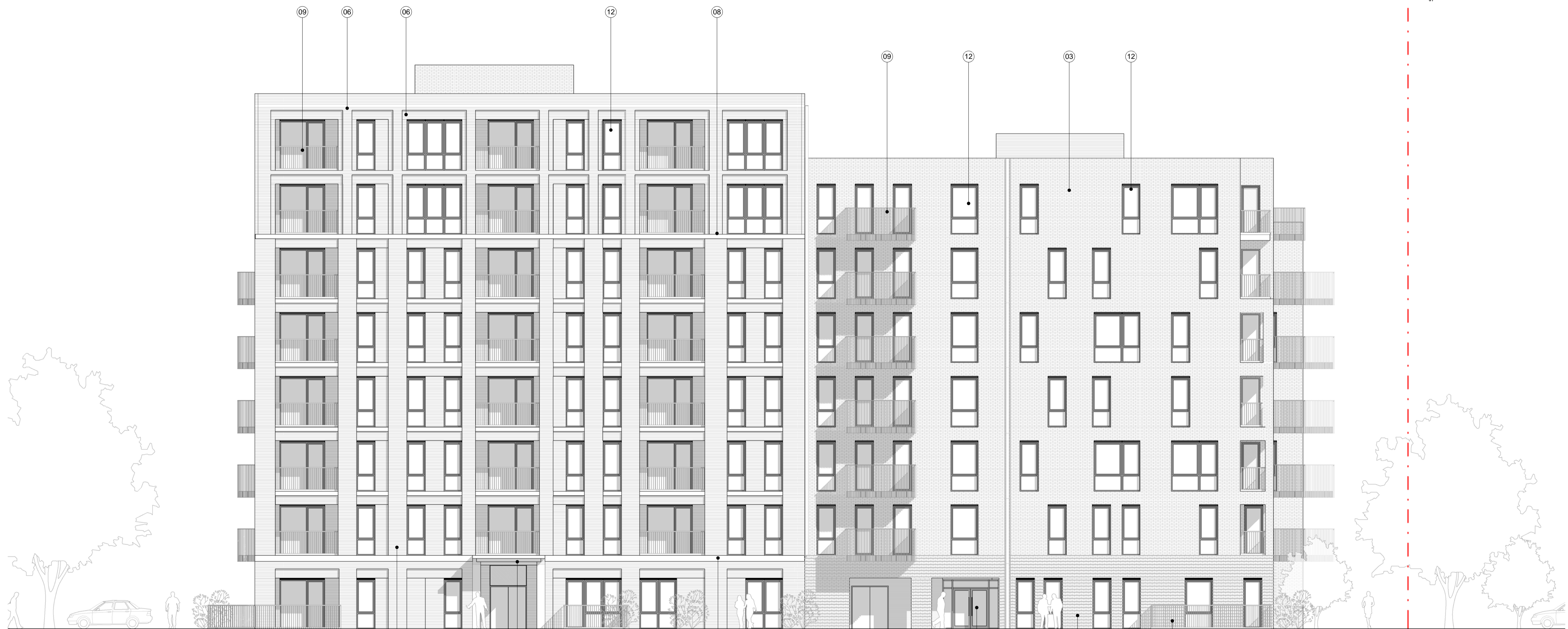
1 P3(S) - East Elevation C - Block 8 1 : 100 @A1

NOTES CONSULTANTS - Refer to highways consultant's drawings for details - Refer to landscape consultant's drawings for details - Landscaping layout is indicative only AREAS - Refer to area schedule © Copyright Reserved. ColladoCollins Partners LLP