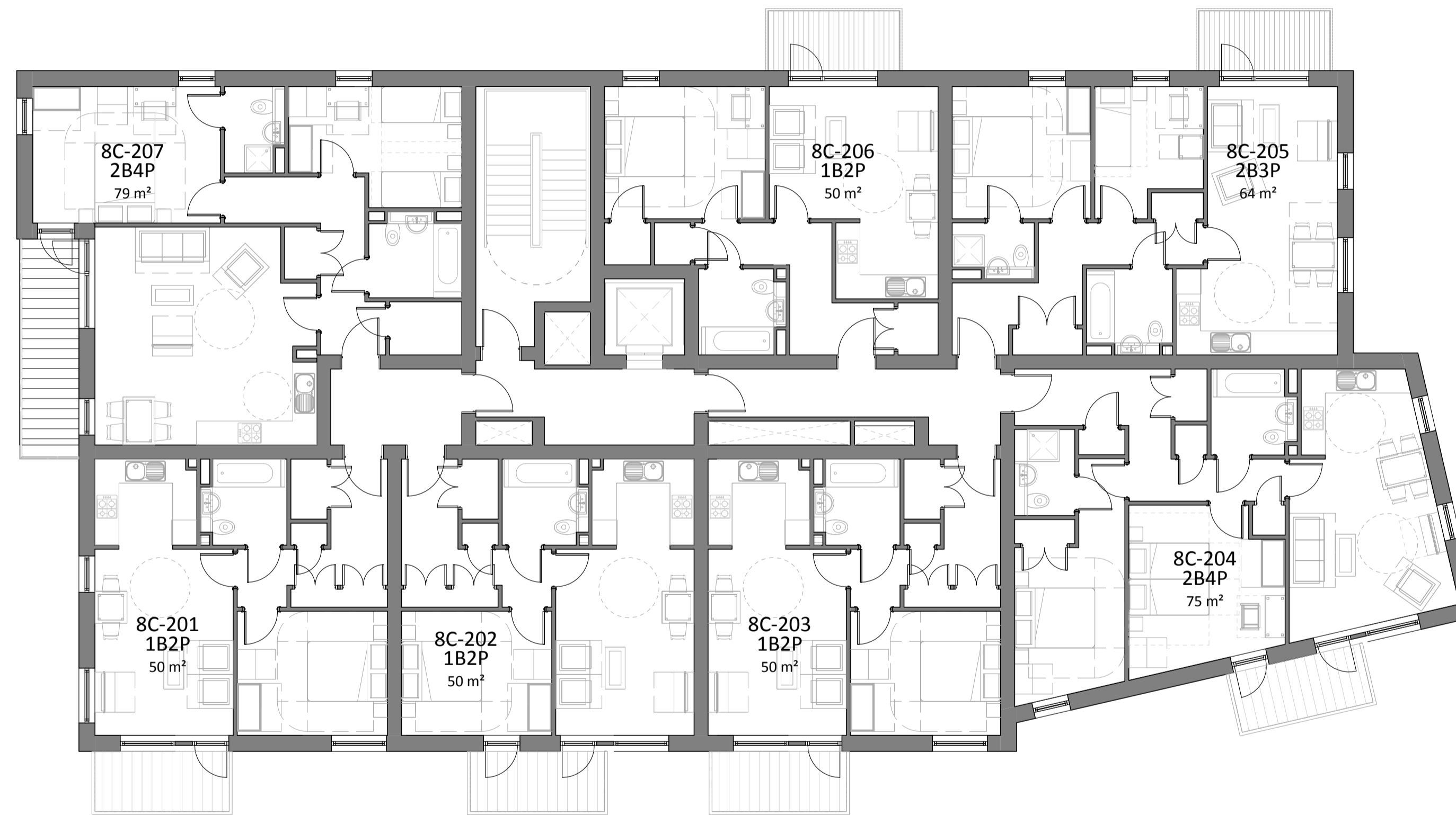
1 Block 8 C Typical Floor - Private