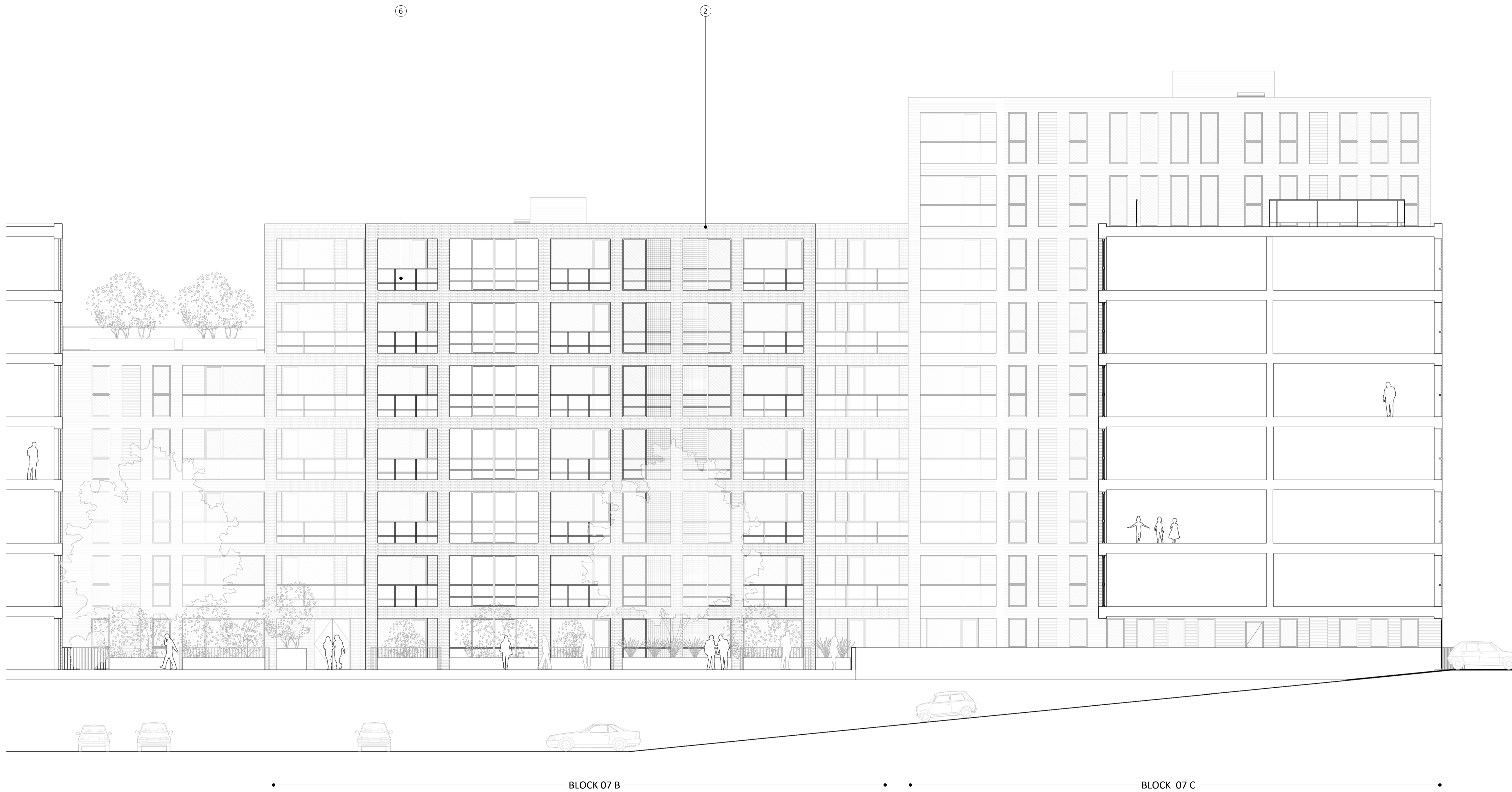
1 Block 07 (7B)- Courtyard West Elevation 1 : 100 @A1

NOTES CONSULTANTS - Refer to highways consultant's drawings for details - Refer to landscape consultant's drawings for details - Landscaping layout is indicative only AREAS - Refer to area schedule © Copyright Reserved. ColladoCollins Partners LLP