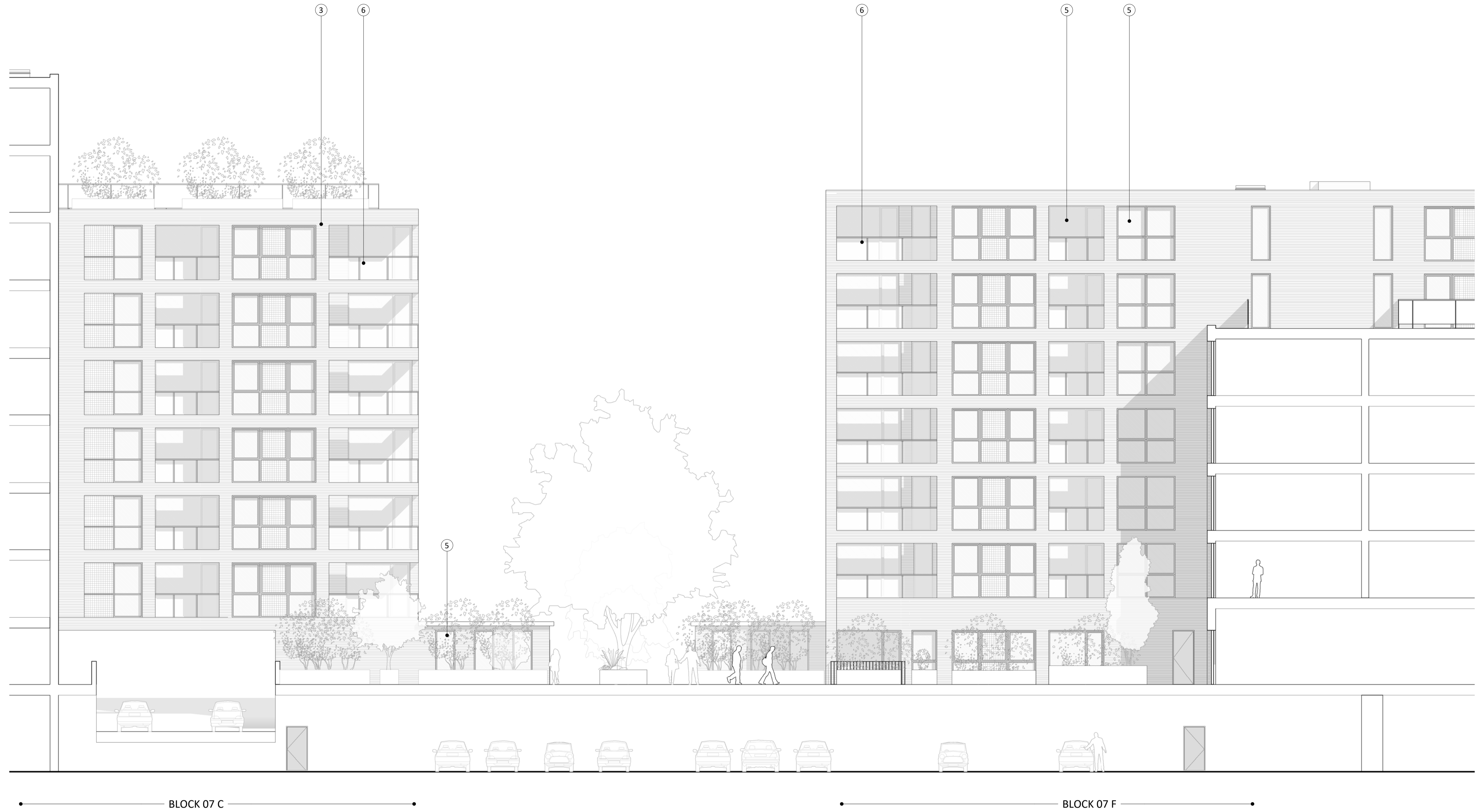
1 Block 07 (7C-7F)-Courtyard Elevation North 1 : 100 @A1

NOTES CONSULTANTS - Refer to highways consultant's drawings for details - Refer to landscape consultant's drawings for details - Landscaping layout is indicative only AREAS - Refer to area schedule © Copyright Reserved. ColladoCollins Partners LLP