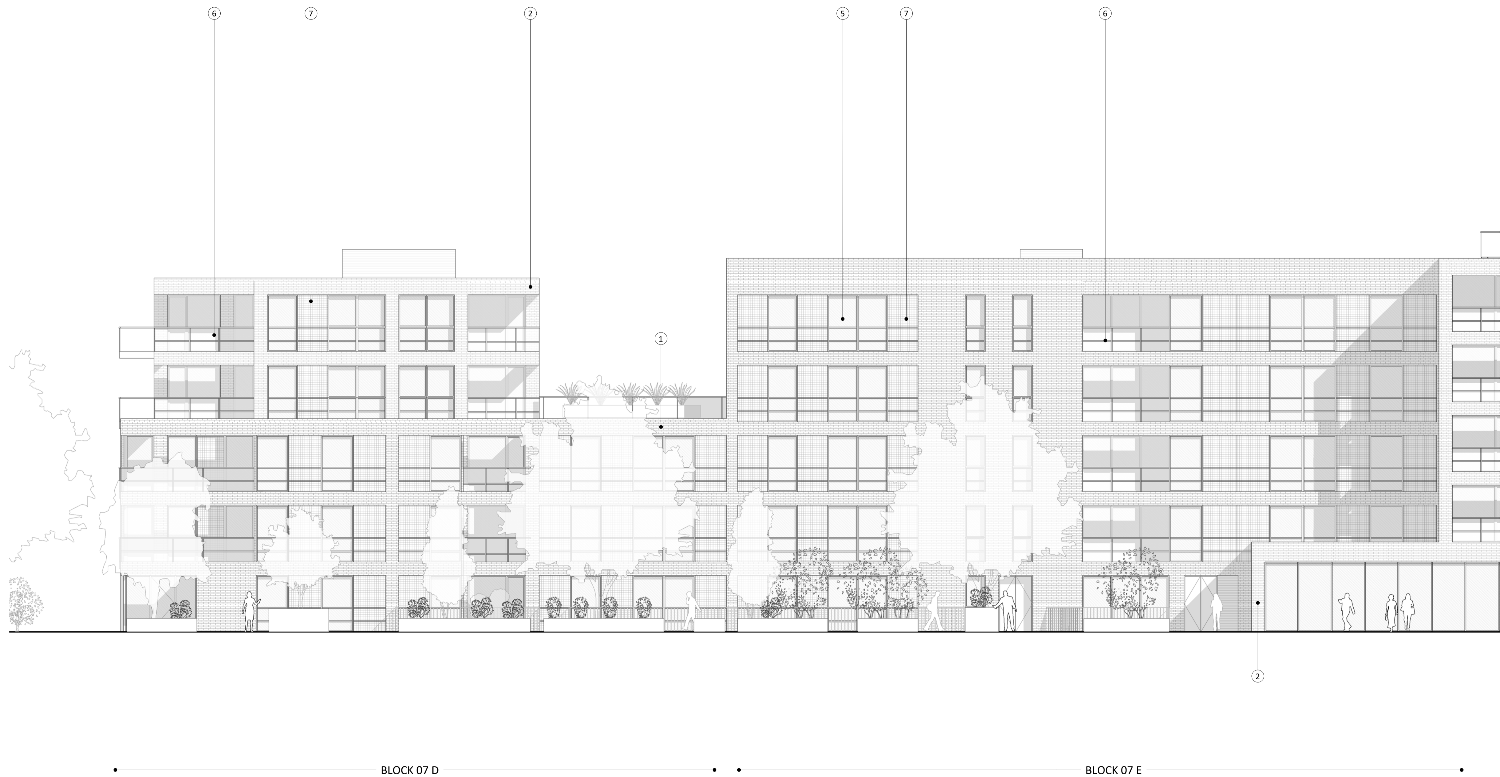
1 Block 07 (7D-7E)-West Elevation 1 : 100 @A1

NOTES CONSULTANTS - Refer to highways consultant's drawings for details - Refer to landscape consultant's drawings for details - Landscaping layout is indicative only AREAS - Refer to area schedule © Copyright Reserved. ColladoCollins Partners LLP