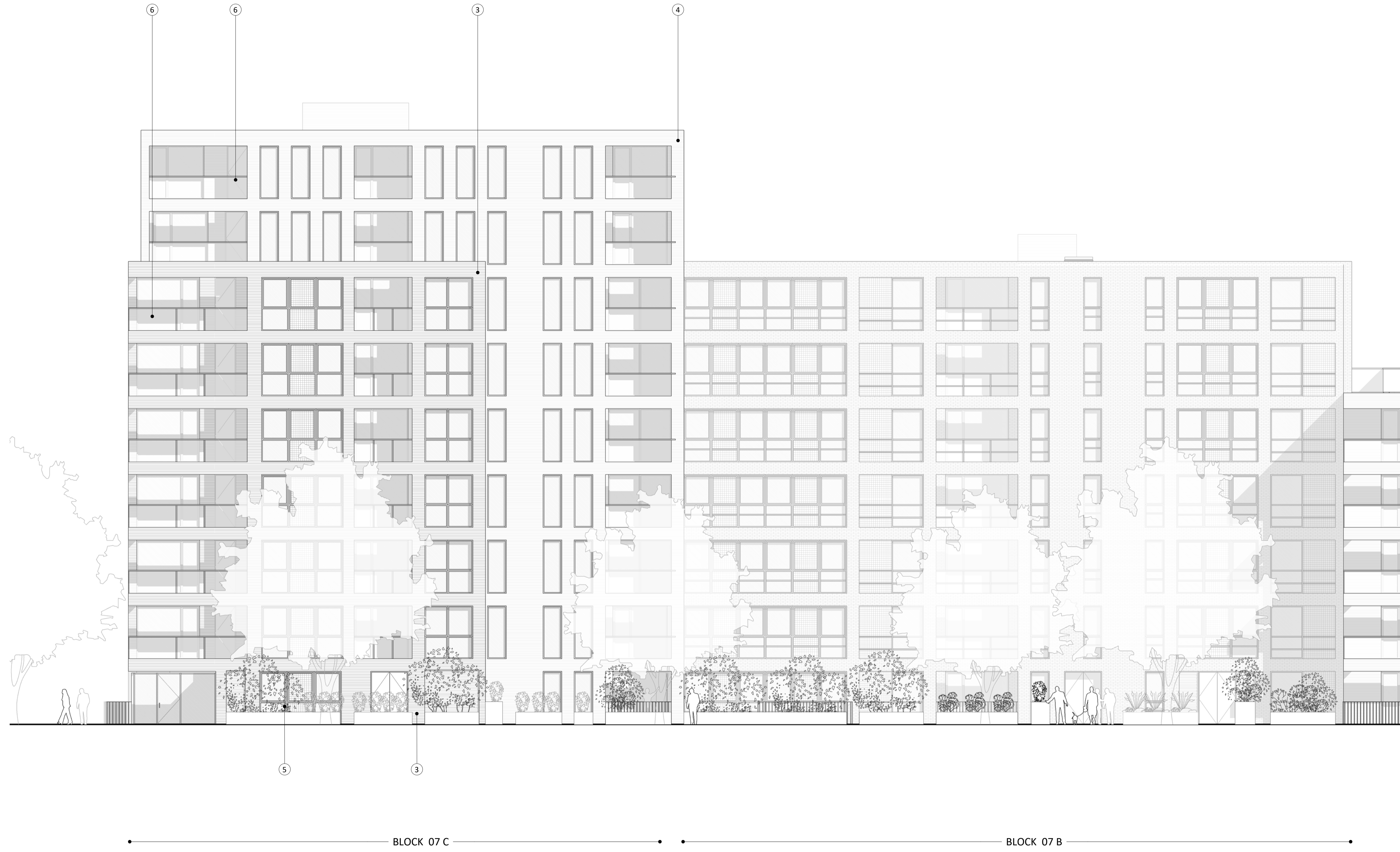
1 Block 07 (7B-7C)-East Elevation 1 : 100 @A1

NOTES CONSULTANTS - Refer to highways consultant's drawings for details - Refer to landscape consultant's drawings for details - Landscaping layout is indicative only AREAS - Refer to area schedule © Copyright Reserved. ColladoCollins Partners LLP