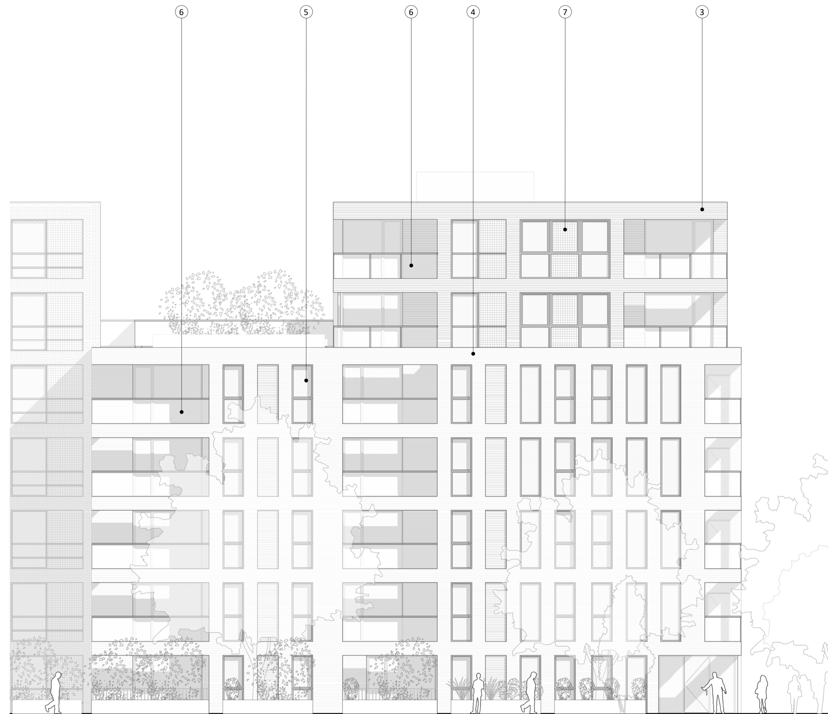
1 Block 07 (7A)-East Elevation 1 : 100 @A1

NOTES CONSULTANTS - Refer to highways consultant's drawings for details - Refer to landscape consultant's drawings for details - Landscaping layout is indicative only AREAS - Refer to area schedule © Copyright Reserved. ColladoCollins Partners LLP