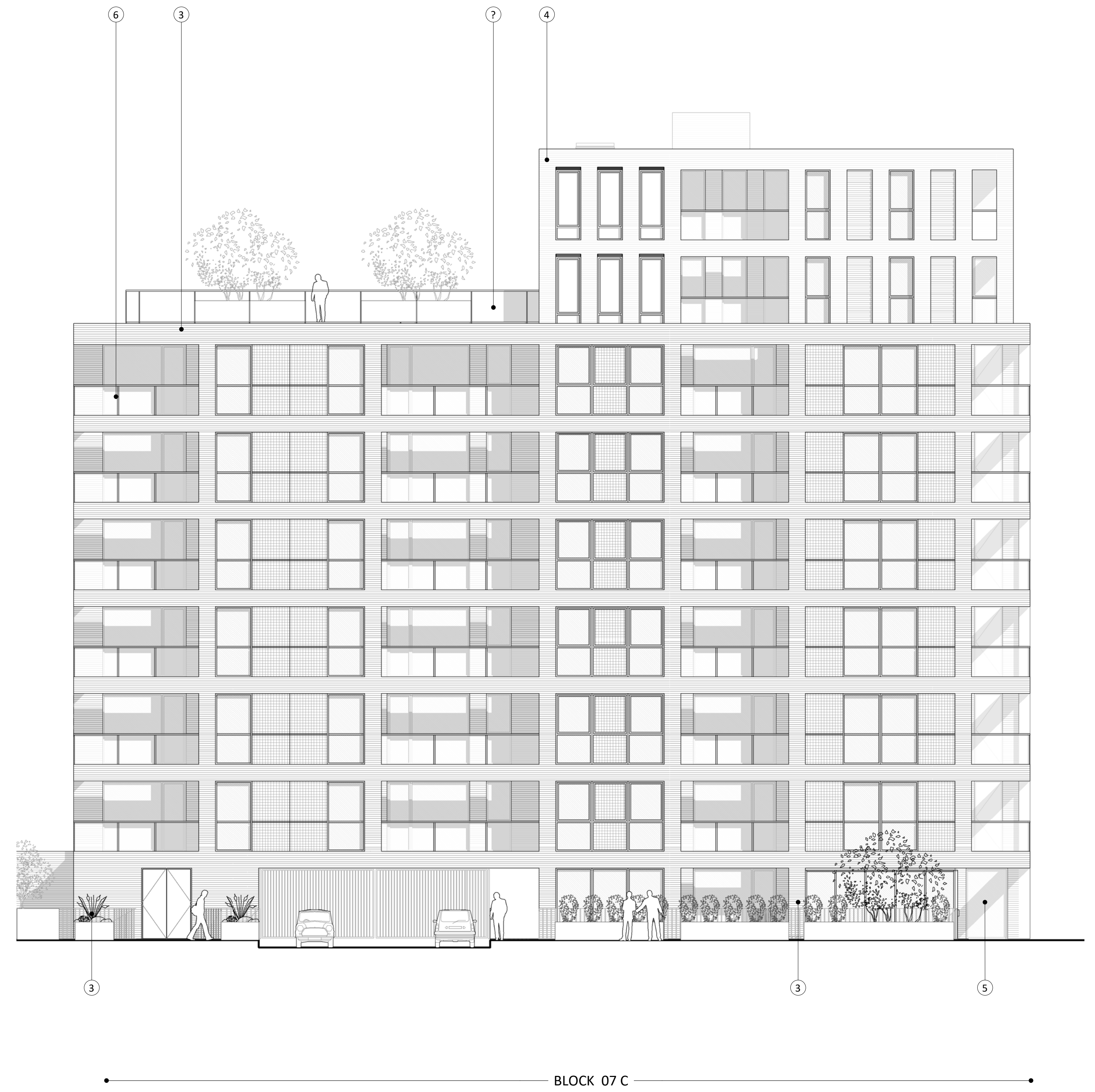
1 Block 07 (7C)-South Elevation 1 : 100 @A1

NOTES CONSULTANTS - Refer to highways consultant's drawings for details - Refer to landscape consultant's drawings for details - Landscaping layout is indicative only AREAS - Refer to area schedule © Copyright Reserved. ColladoCollins Partners LLP