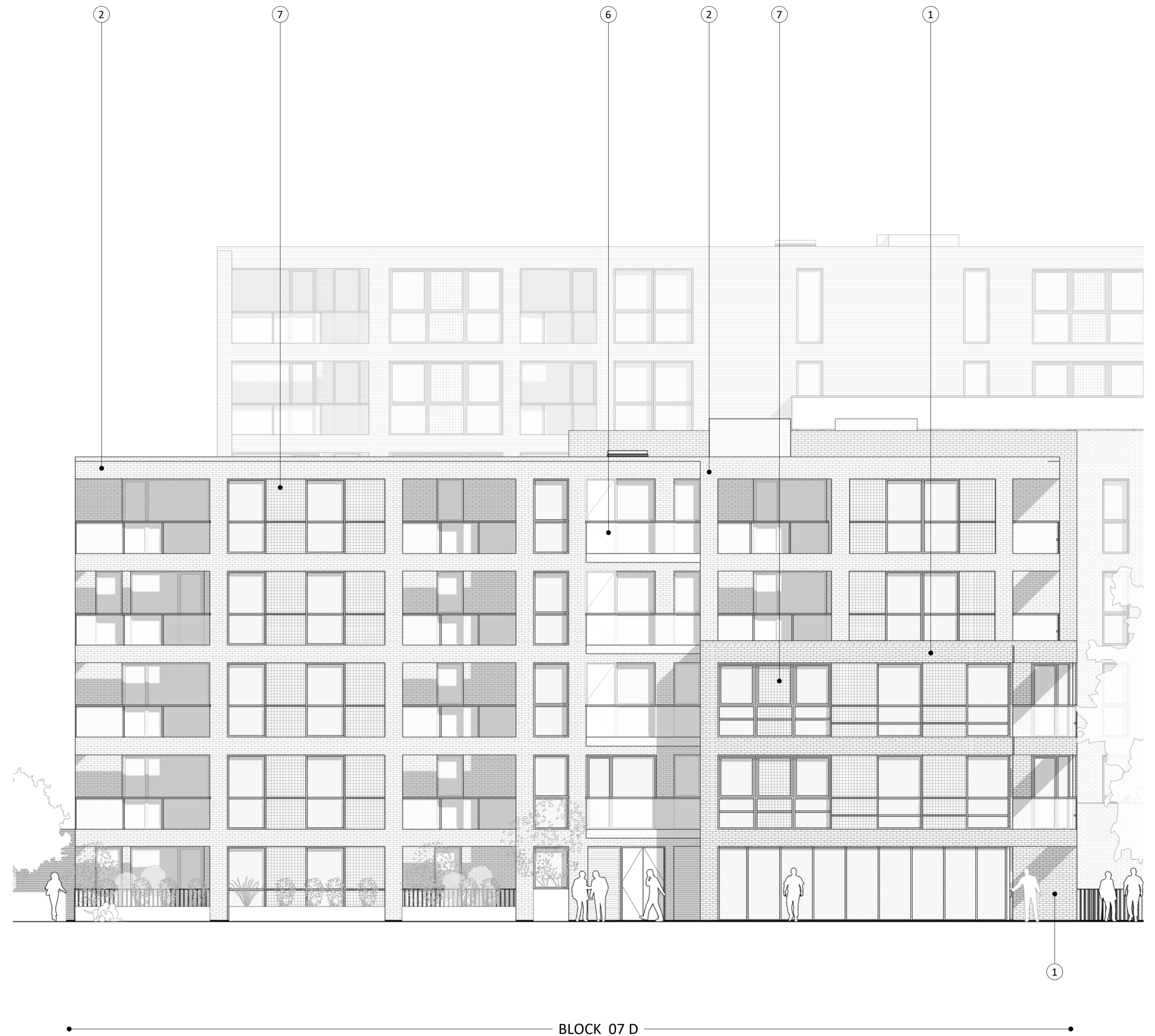
2 Block 07 (7D)-North Elevation 1 : 100 @A1

NOTES CONSULTANTS - Refer to highways consultant's drawings for details - Refer to landscape consultant's drawings for details - Landscaping layout is indicative only AREAS - Refer to area schedule © Copyright Reserved. ColladoCollins Partners LLP