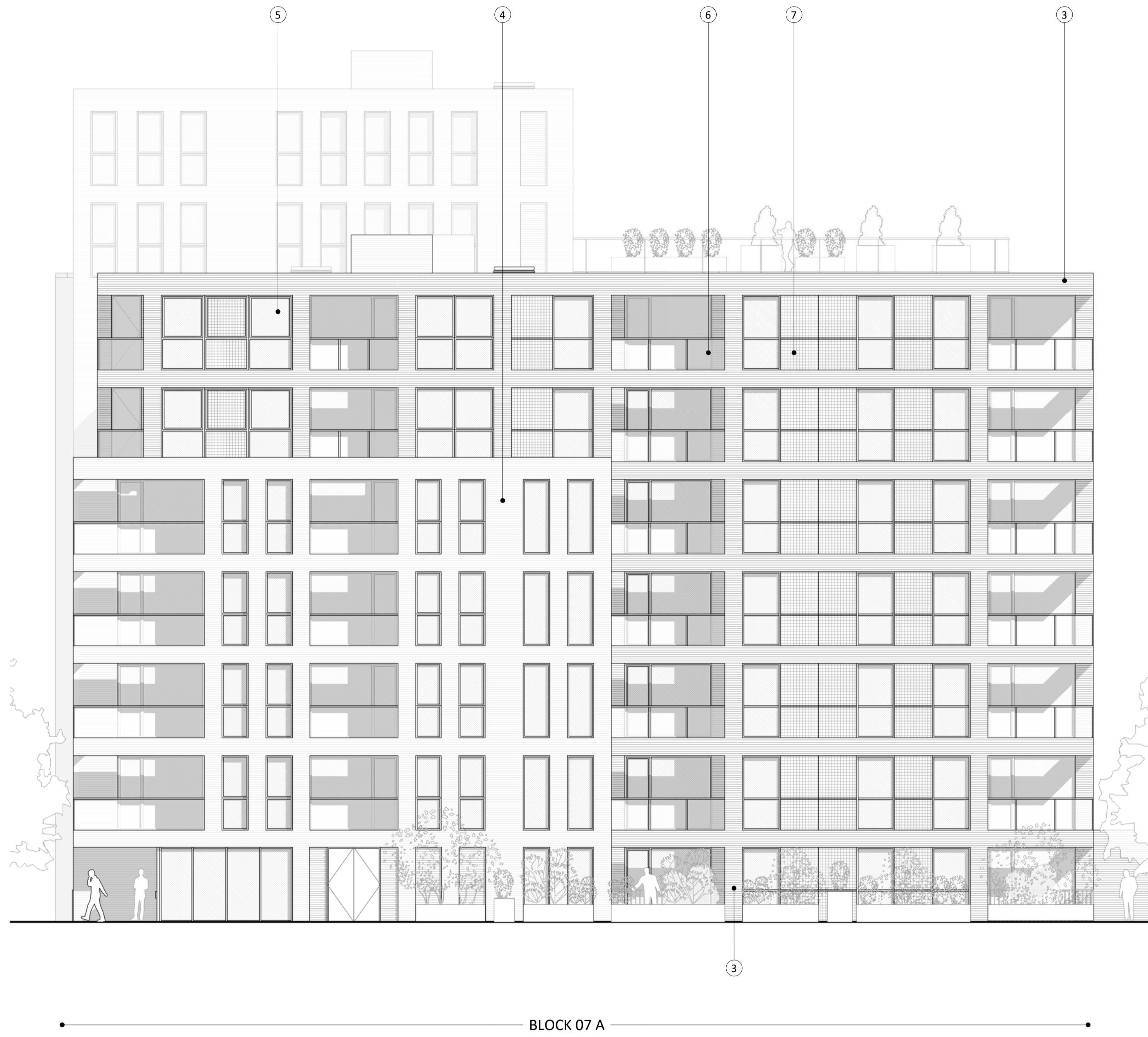
1 Block 07 (7A)-North Elevation 1 : 100 @A1