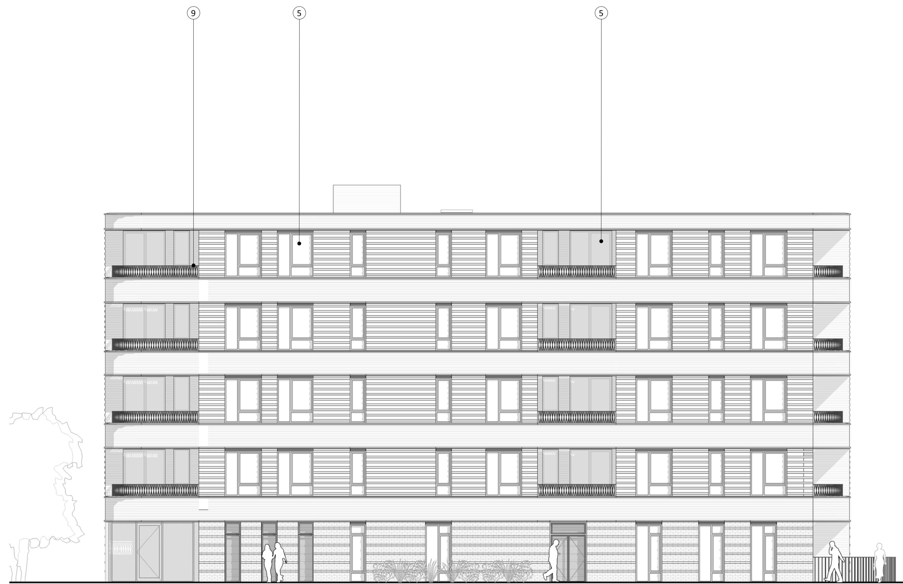
1 Block 06E - North Elevation 1 : 100 @A1