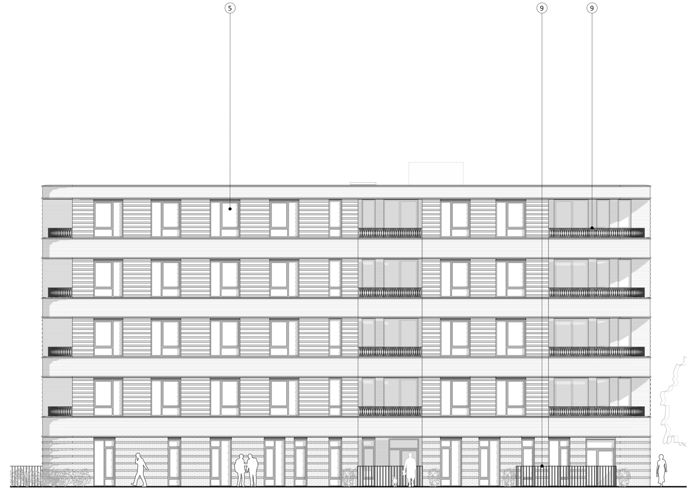
2 Block 06E - South Elevation 1 : 100 @A1

NOTES CONSULTANTS - Refer to highways consultant's drawings for details - Refer to landscape consultant's drawings for details - Landscaping layout is indicative only AREAS - Refer to area schedule © Copyright Reserved. ColladoCollins Partners LLP