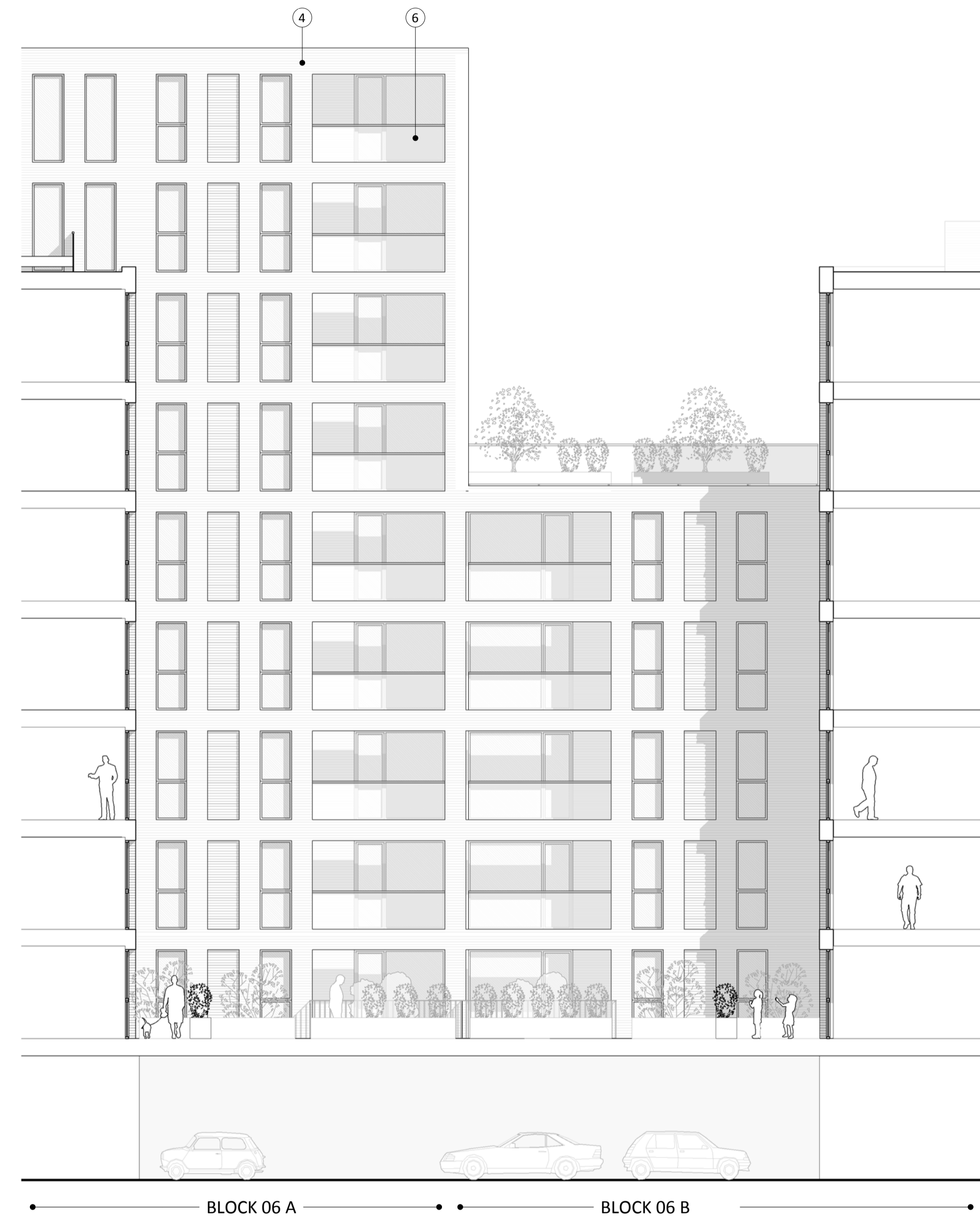
2 Block 06 (6A-6B)-Courtyard Elevation West 1 : 100 @A1

NOTES CONSULTANTS - Refer to highways consultant's drawings for details - Refer to landscape consultant's drawings for details - Landscaping layout is indicative only AREAS - Refer to area schedule © Copyright Reserved. ColladoCollins Partners LLP