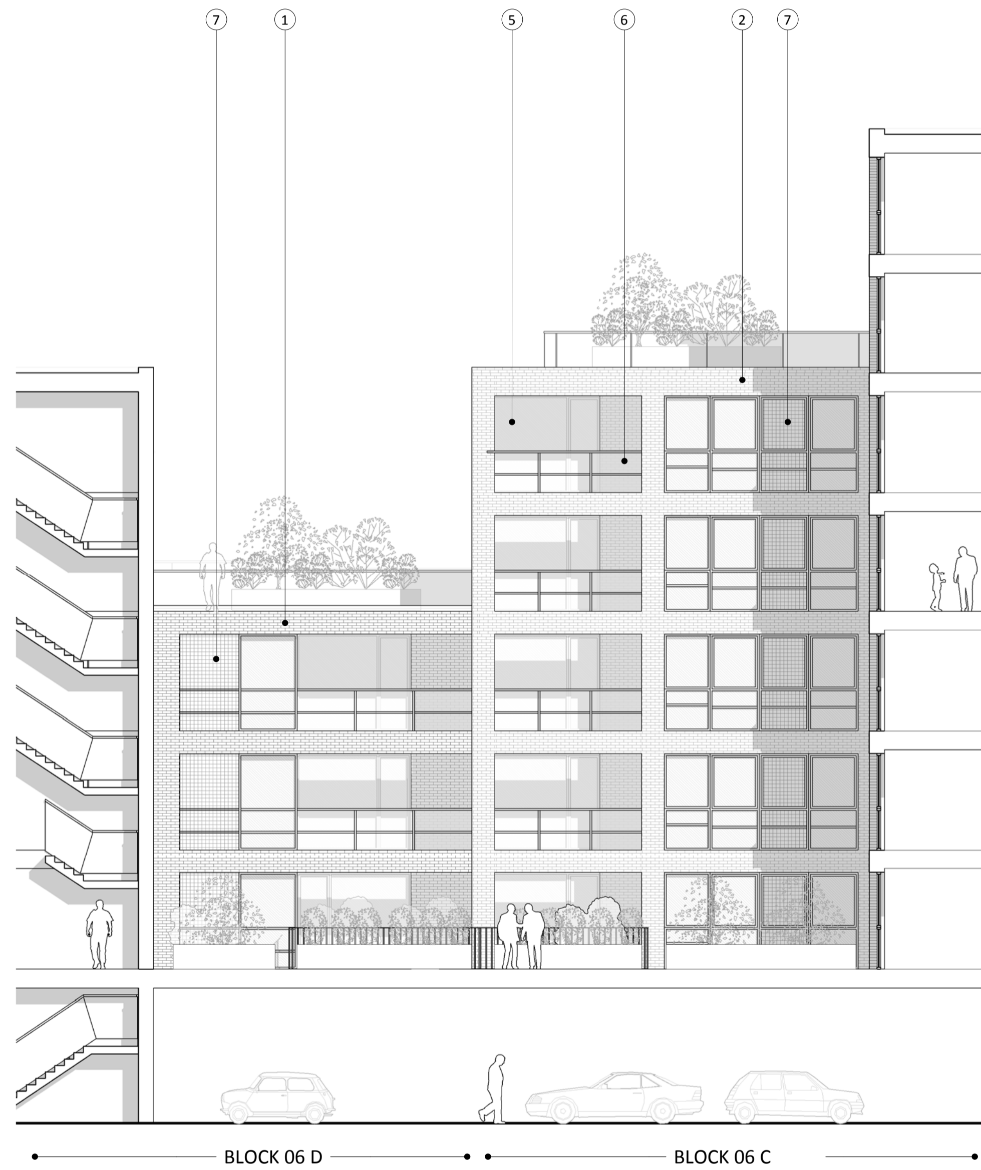
1 Block 06 (6C-6D)-Courtyard Elevation East 1 : 100 @A1