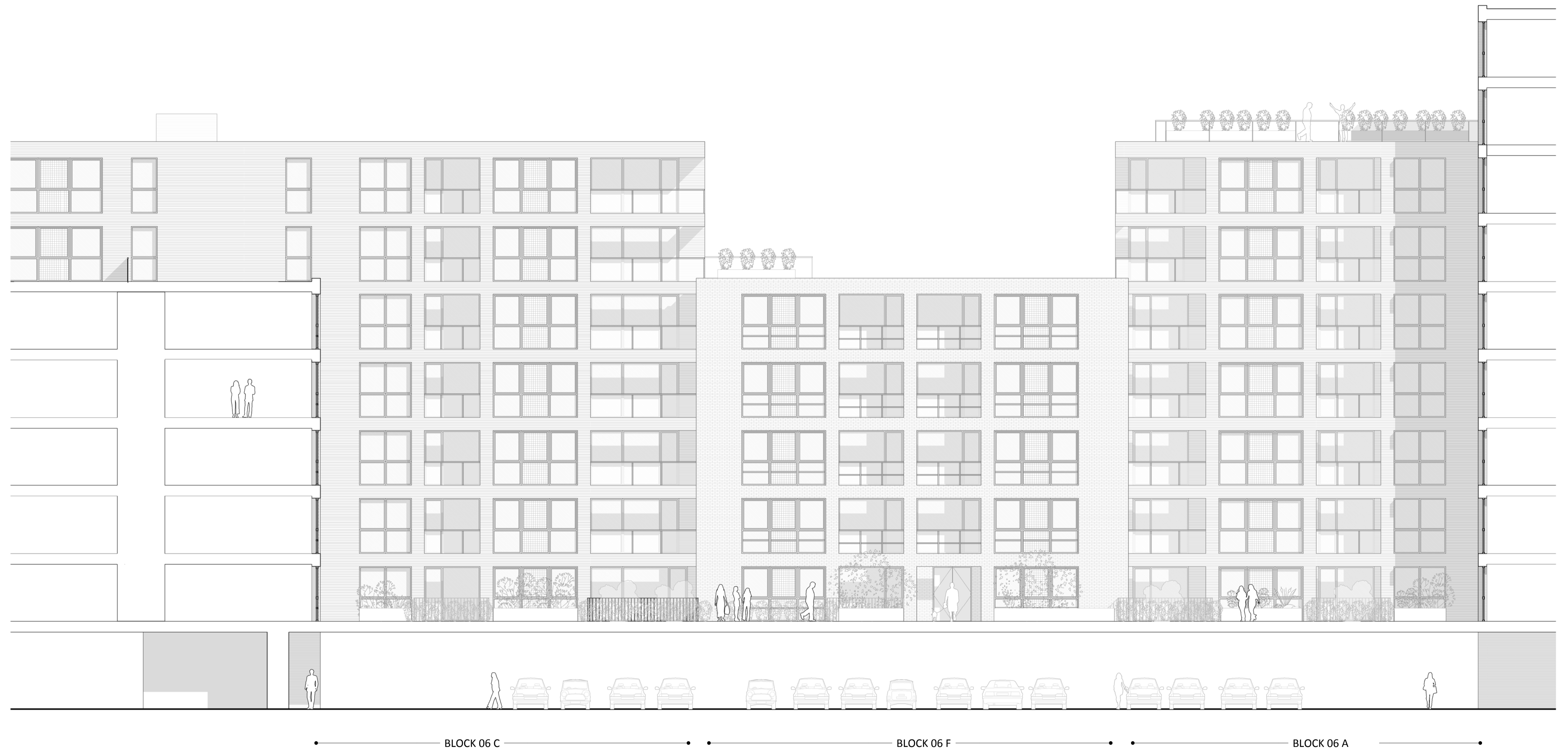
1 Block 06 (6A-6C)-Courtyard Elevation South 1:100 @A1

NOTES CONSULTANTS - Refer to highways consultant's drawings for details - Refer to landscape consultant's drawings for details - Landscaping layout is indicative only AREAS - Refer to area schedule © Copyright Reserved. ColladoCollins Partners LLP