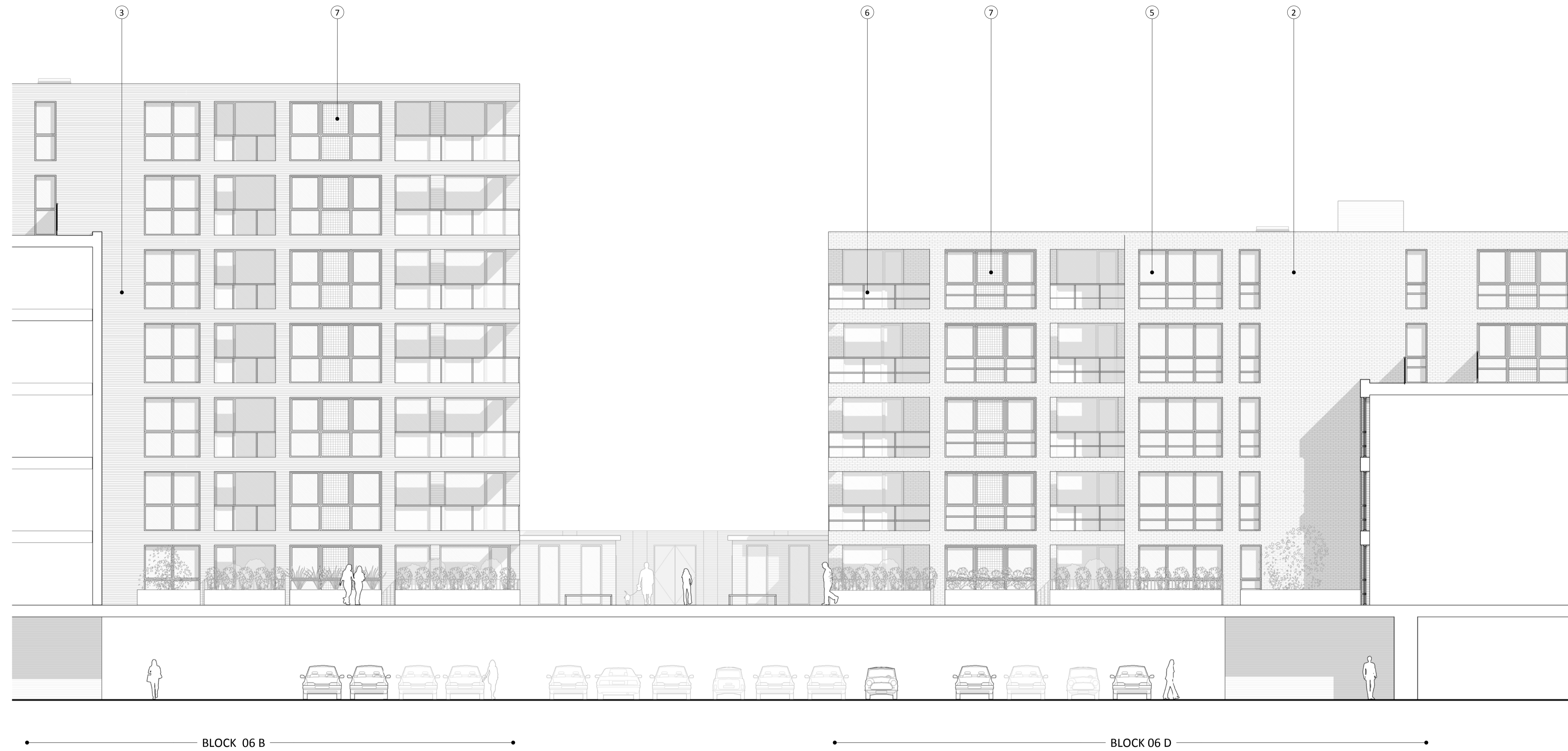
1 Block 06 (6B-6D) Courtyard Elevation North 1 : 100 @A1

NOTES CONSULTANTS - Refer to highways consultant's drawings for details - Refer to landscape consultant's drawings for details - Landscaping layout is indicative only AREAS - Refer to area schedule © Copyright Reserved. ColladoCollins Partners LLP