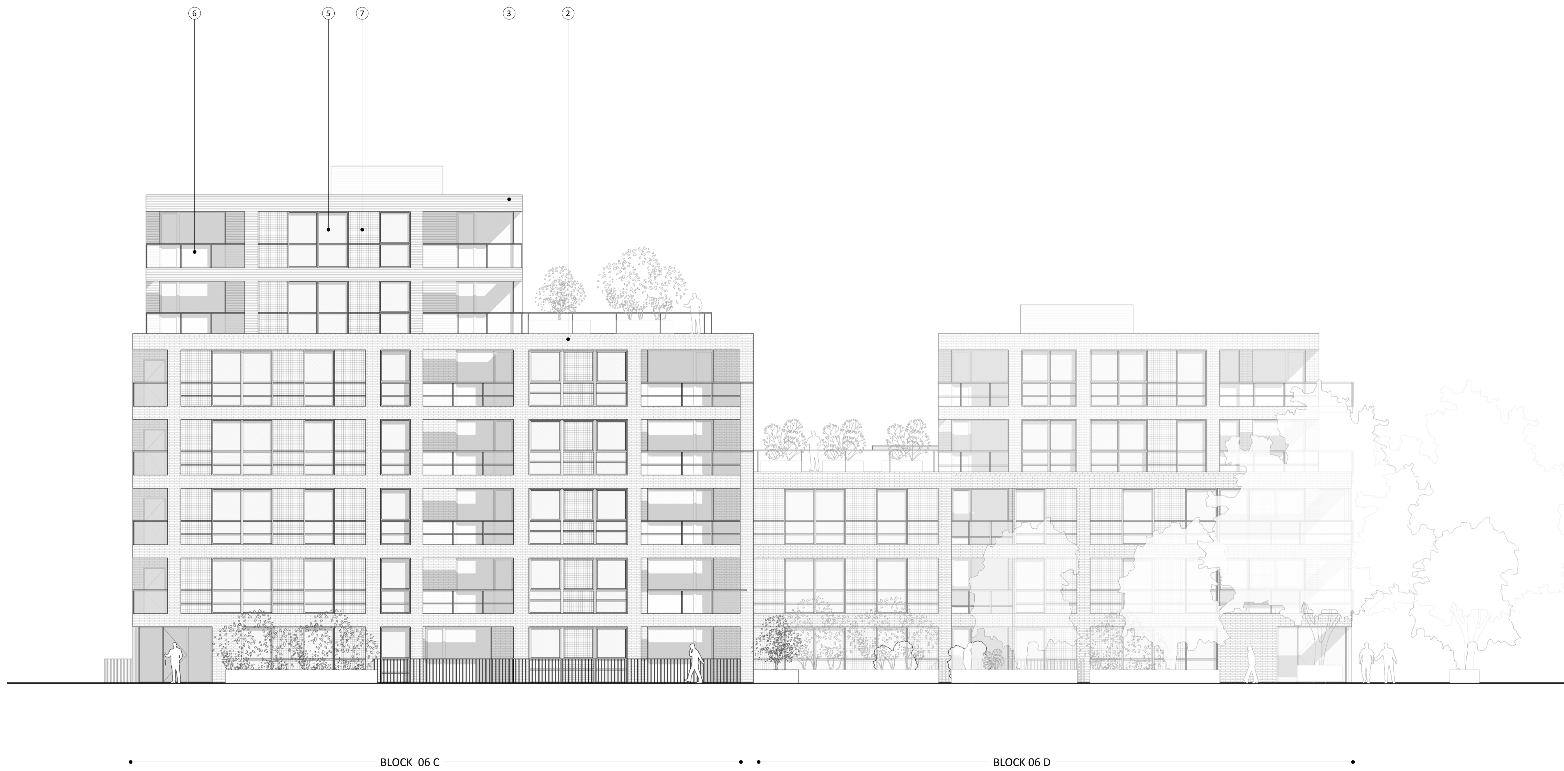
1 Block 06 (6C-6D) - West Elevation 1 : 100 @A1

NOTES CONSULTANTS - Refer to highways consultant's drawings for details - Refer to landscape consultant's drawings for details - Landscaping layout is indicative only AREAS - Refer to area schedule © Copyright Reserved. ColladoCollins Partners LLP