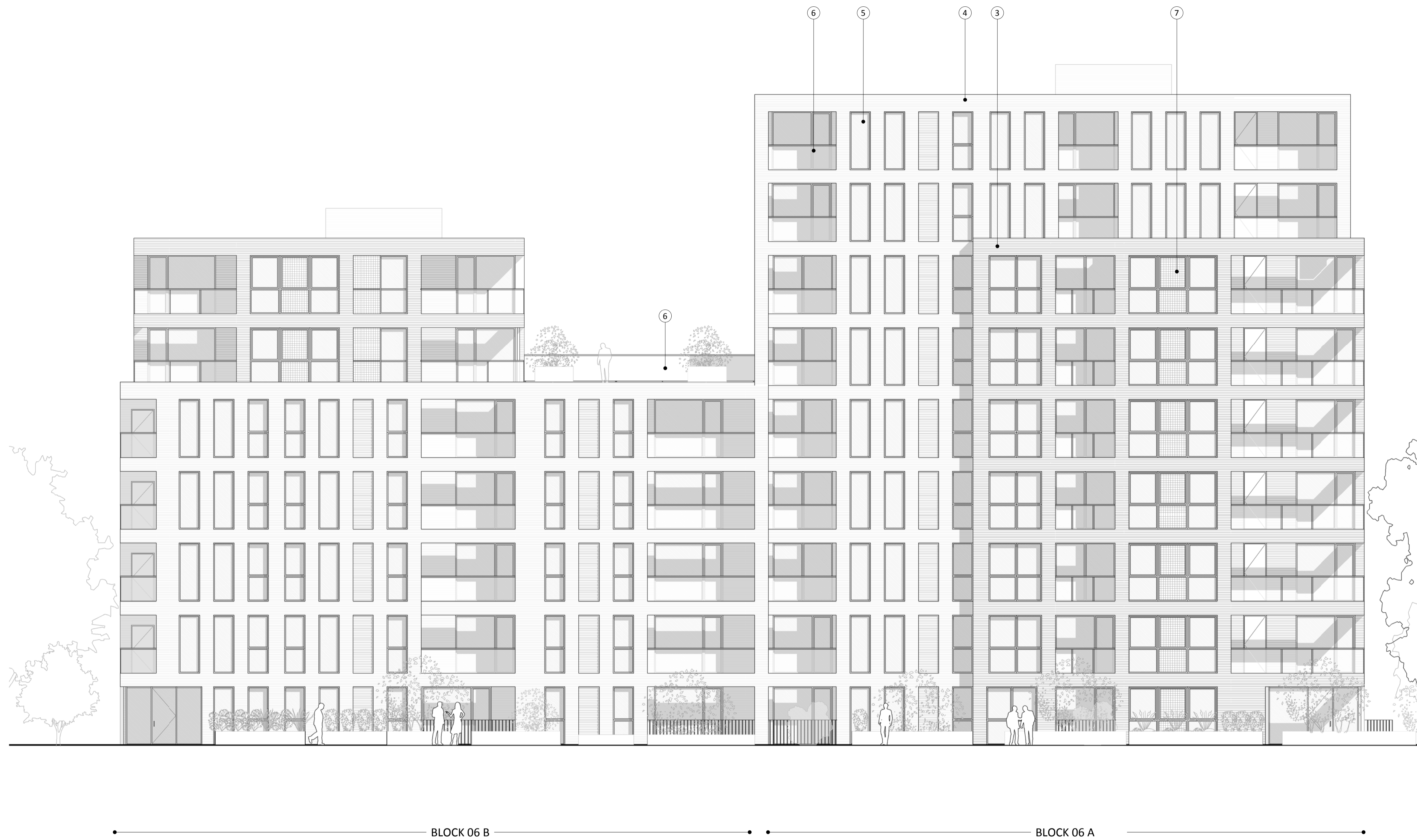
1 Block 06 (6A-6B) - East Elevation 1 : 100 @A1

NOTES CONSULTANTS - Refer to highways consultant's drawings for details - Refer to landscape consultant's drawings for details - Landscaping layout is indicative only AREAS - Refer to area schedule © Copyright Reserved. ColladoCollins Partners LLP