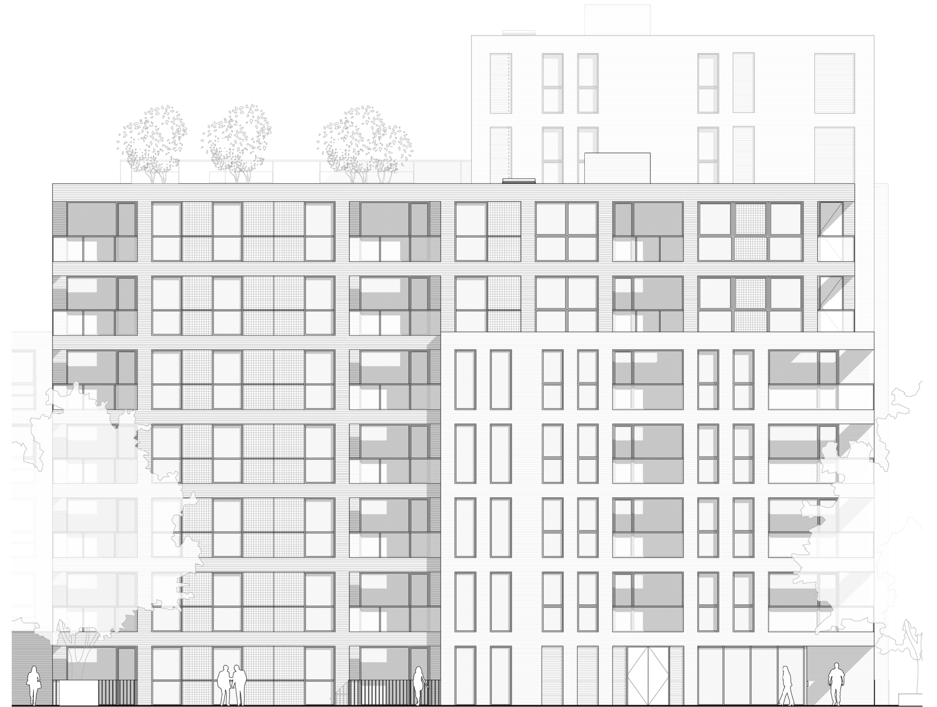
BLOCK 06 B