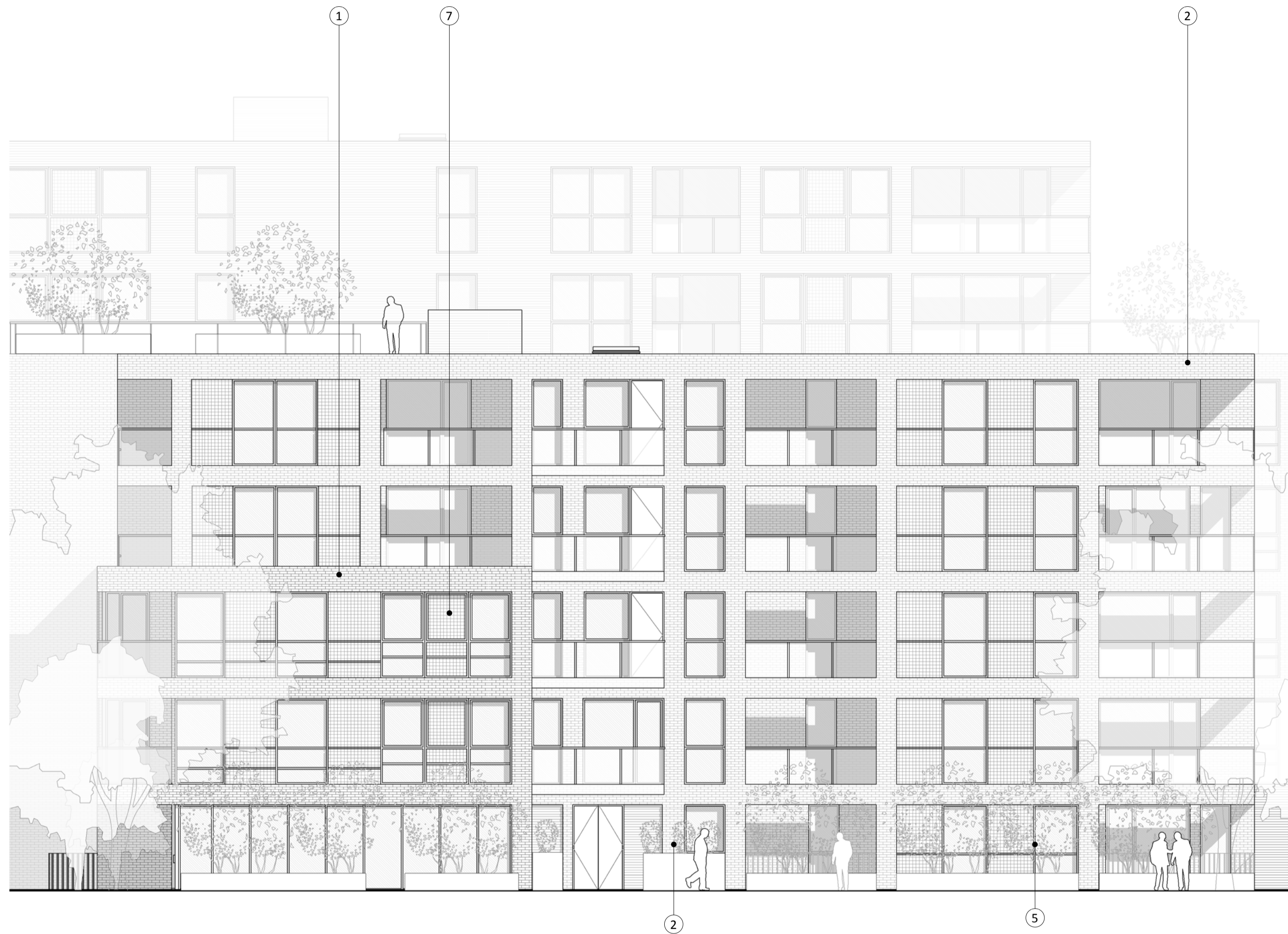
BLOCK 06 D