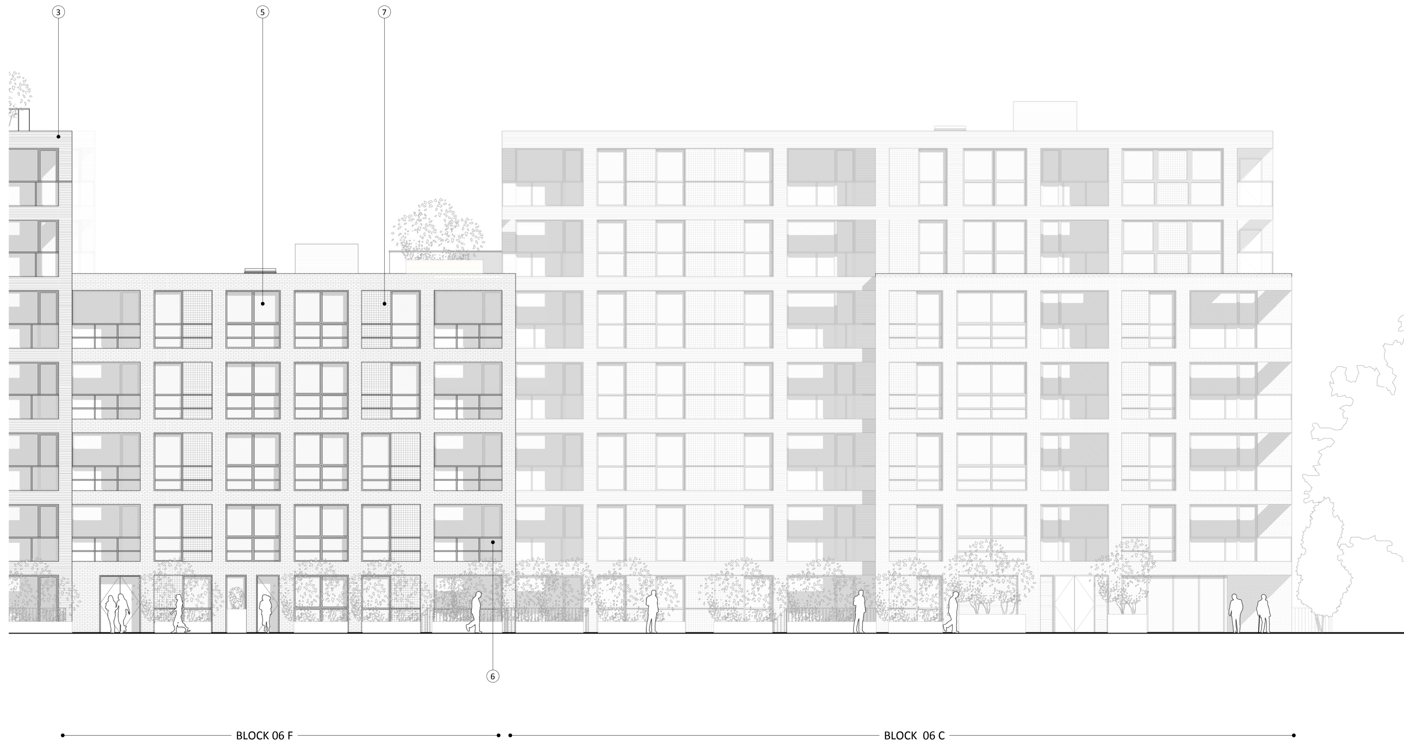
1 Block 06 (6C-6F) - North Elevation 1 : 100 @A1

NOTES CONSULTANTS - Refer to highways consultant's drawings for details - Refer to landscape consultant's drawings for details - Landscaping layout is indicative only AREAS - Refer to area schedule © Copyright Reserved. ColladoCollins Partners LLP