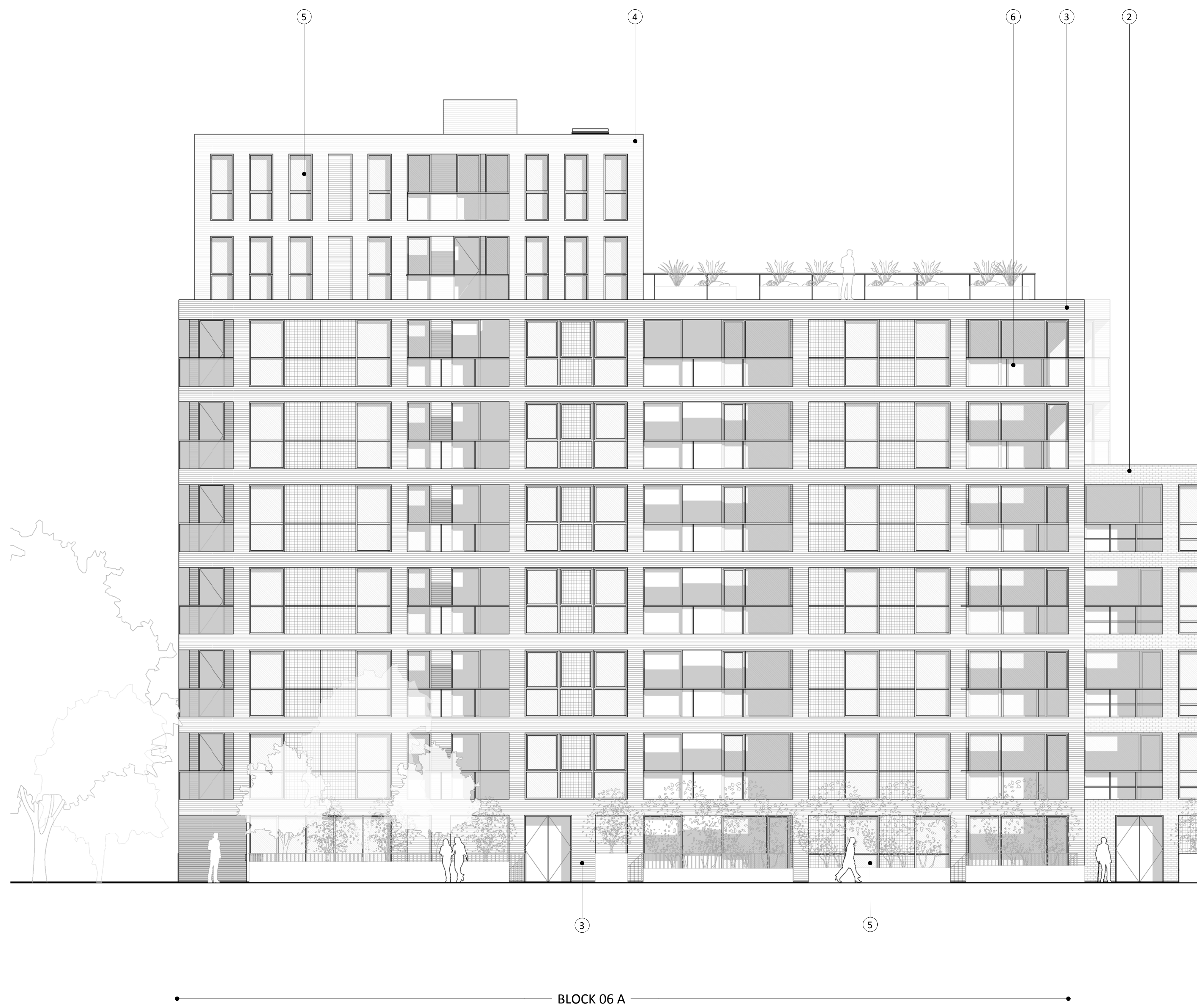
1 Block 06 (6A) - North Elevation 1 : 100 @A1

NOTES CONSULTANTS - Refer to highways consultant's drawings for details - Refer to landscape consultant's drawings for details - Landscaping layout is indicative only AREAS - Refer to area schedule © Copyright Reserved. ColladoCollins Partners LLP