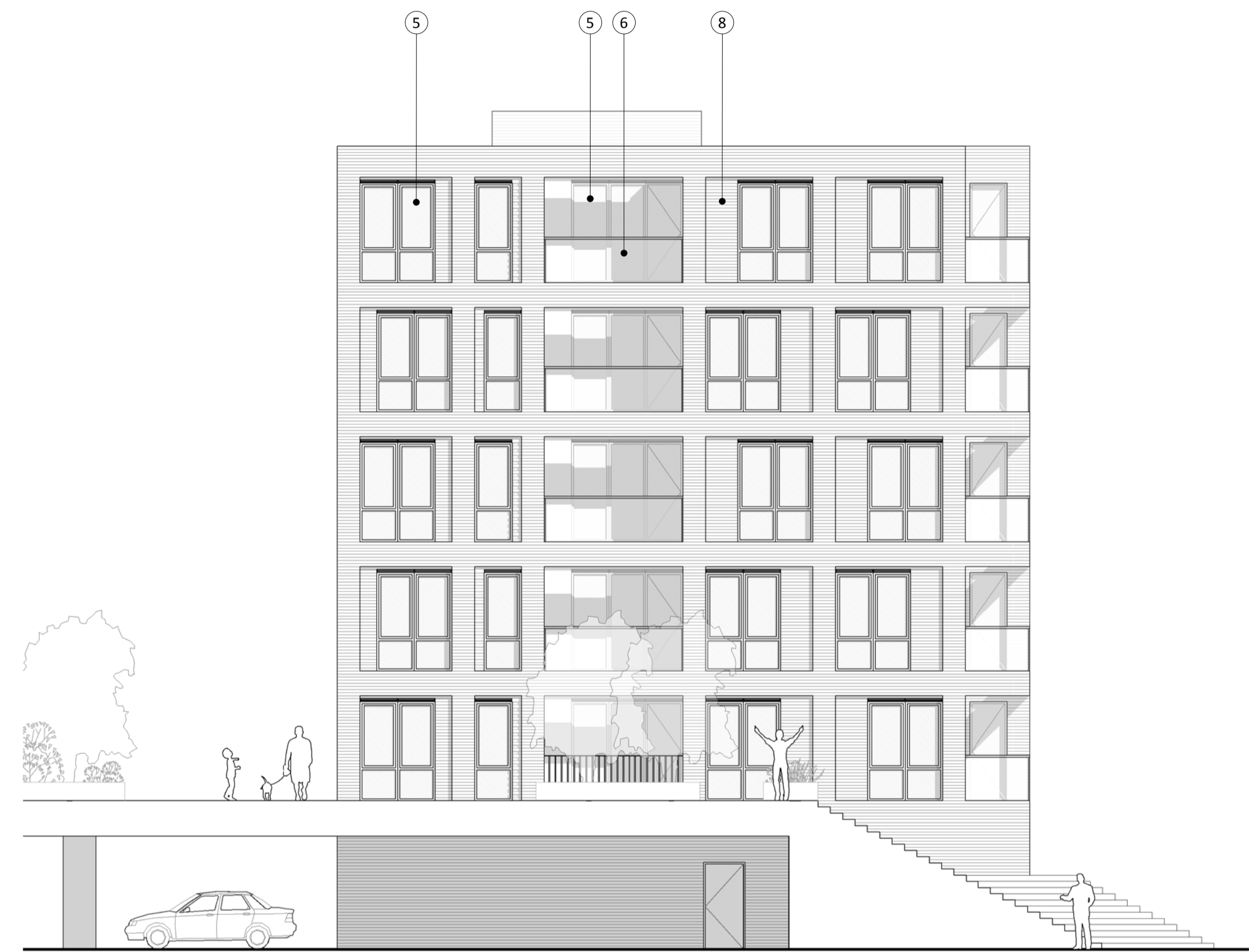
BLOCK 02 C