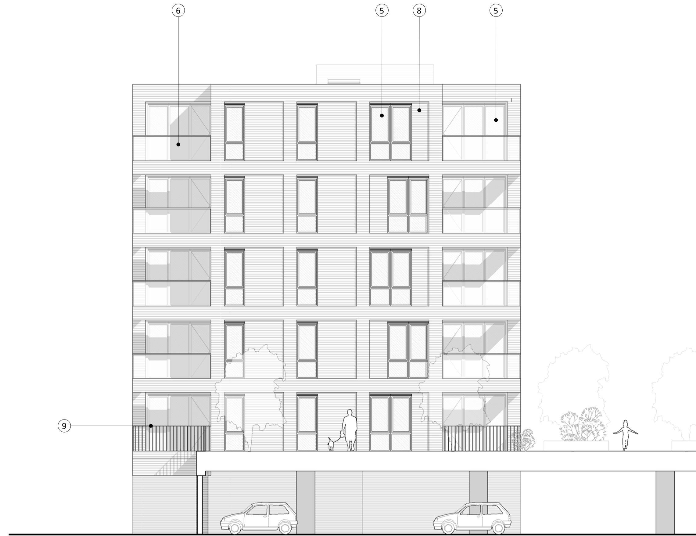
BLOCK 02 C